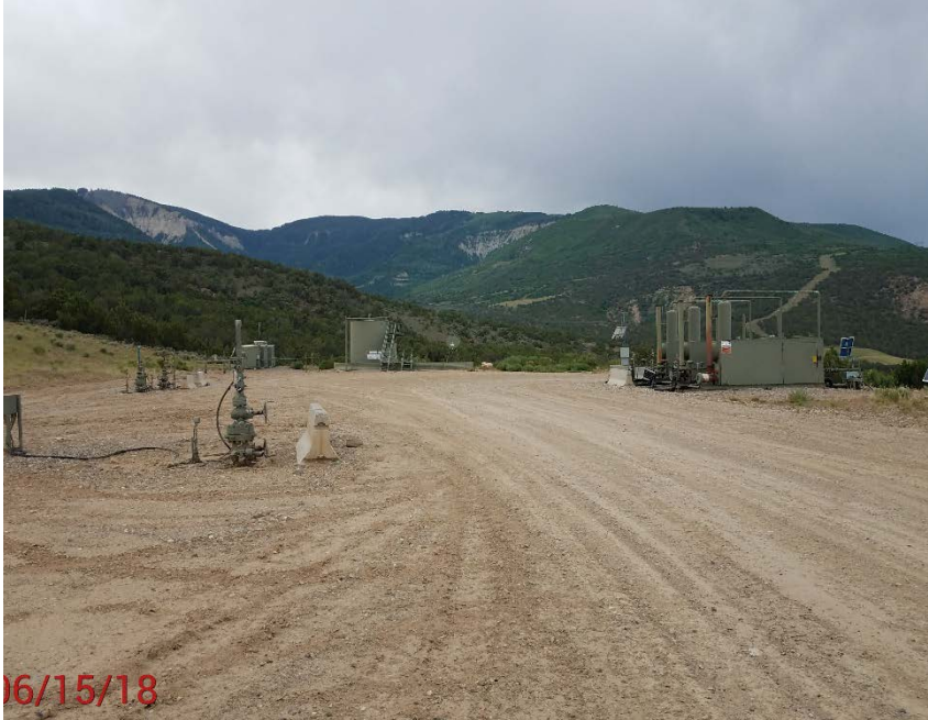
Location Photo #1,