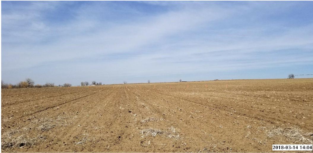
PICTURE OF MCNEAR 10-9 PAD WELL PAD LOCATION - CAMERA ANGLE NORTH