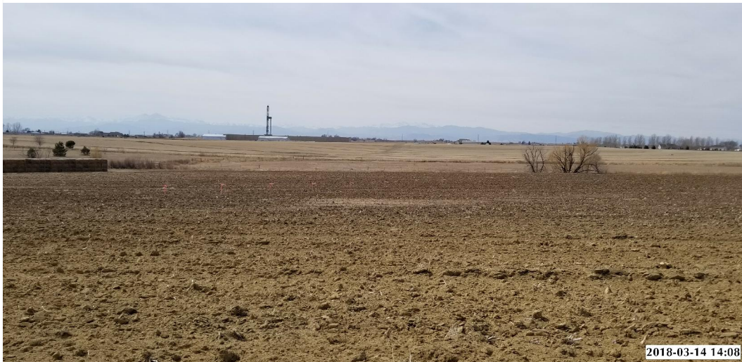
PICTURE OF MCNEAR 10-9 PAD WELL PAD LOCATION - CAMERA ANGLE WEST