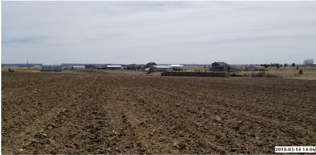
PICTURE OF MCNEAR 10-9 PAD WELL PAD LOCATION - CAMERA ANGLE SOUTH