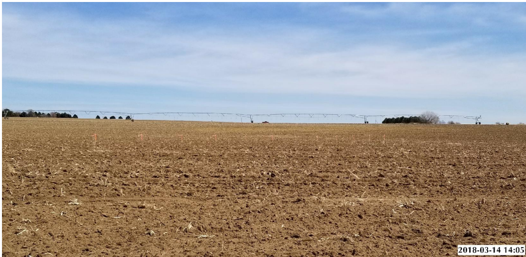
PICTURE OF MCNEAR 10-9 PAD WELL PAD LOCATION - CAMERA ANGLE EAST