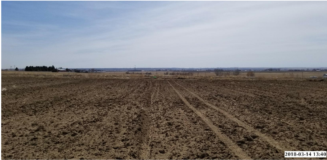
PICTURE OF MCNEAR 10-9 PAD FACILITY PAD LOCATION - CAMERA ANGLE SOUTH