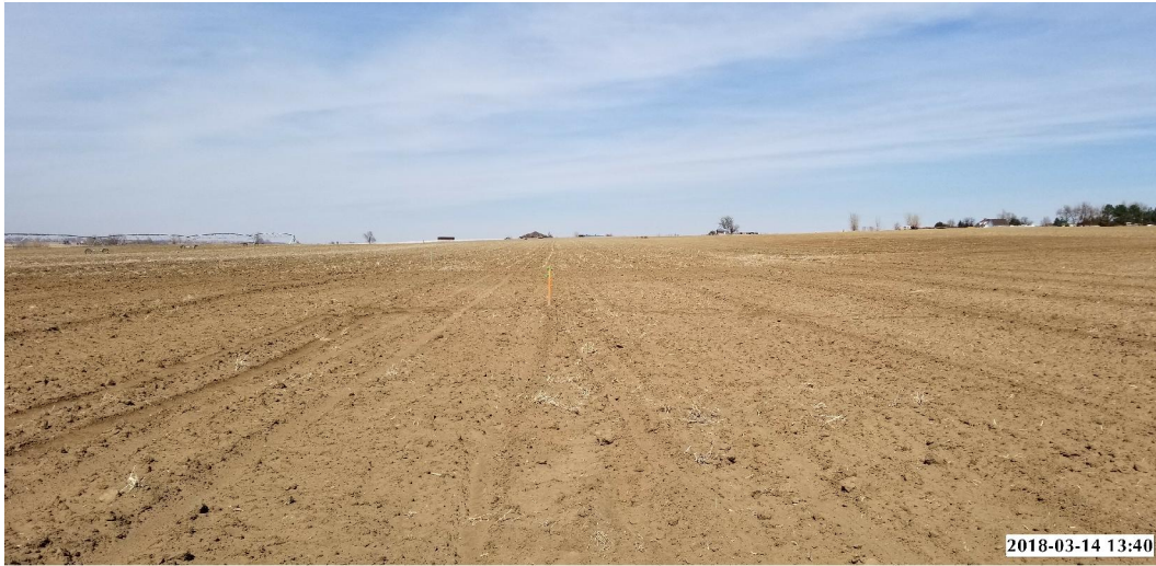
PICTURE OF MCNEAR 10-9 PAD FACILITY PAD LOCATION - CAMERA ANGLE NORTH