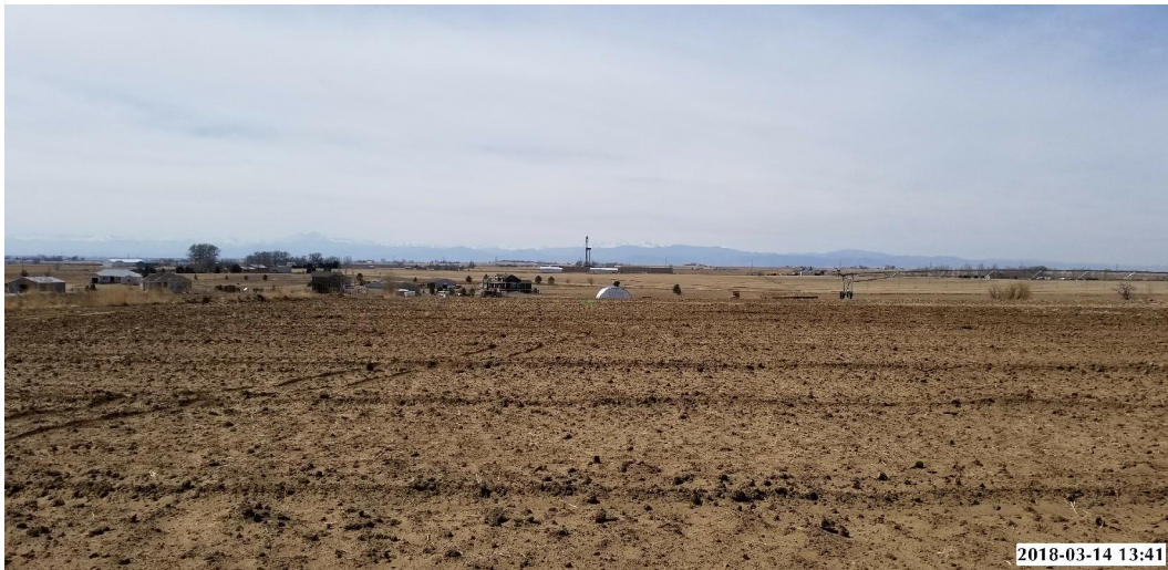
PICTURE OF MCNEAR 10-9 PAD FACILITY PAD LOCATION - CAMERA ANGLE WEST