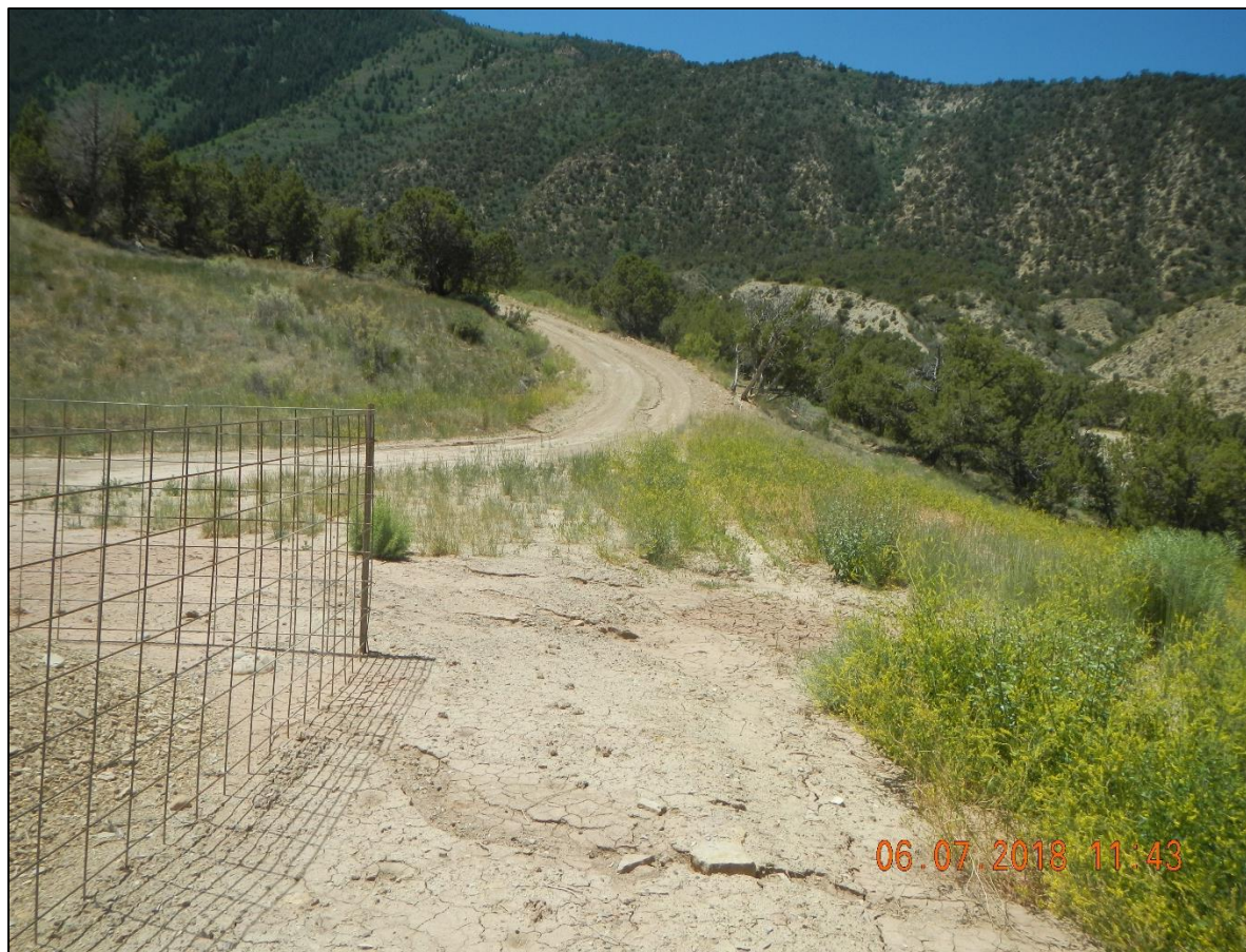
Sediment and washing from road storm water run off.

Federal GM 21-10 Api# 05-045-7548 Inspection # 689701436