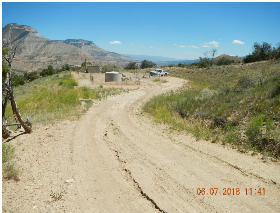
Ruts washing and moving sediment on to location.

Federal GM 21-10 Api# 05-045-7548 Inspection # 689701436