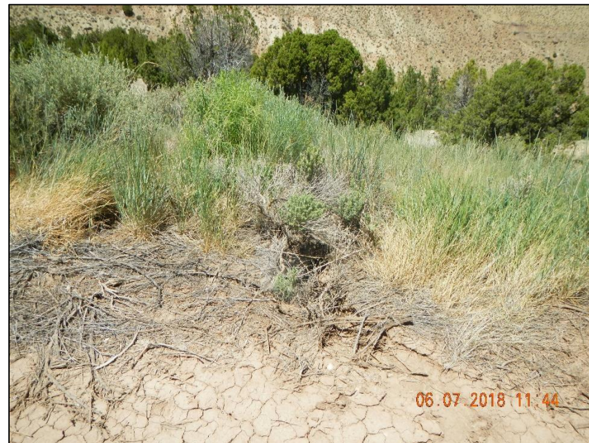
Channeling off location behind separator.