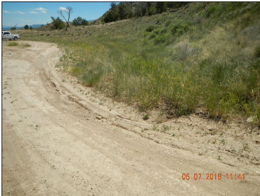
Wash out of ditch wall at entrance.