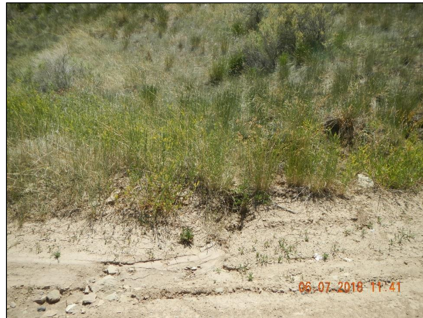
Wash out of ditch wall at entrance.