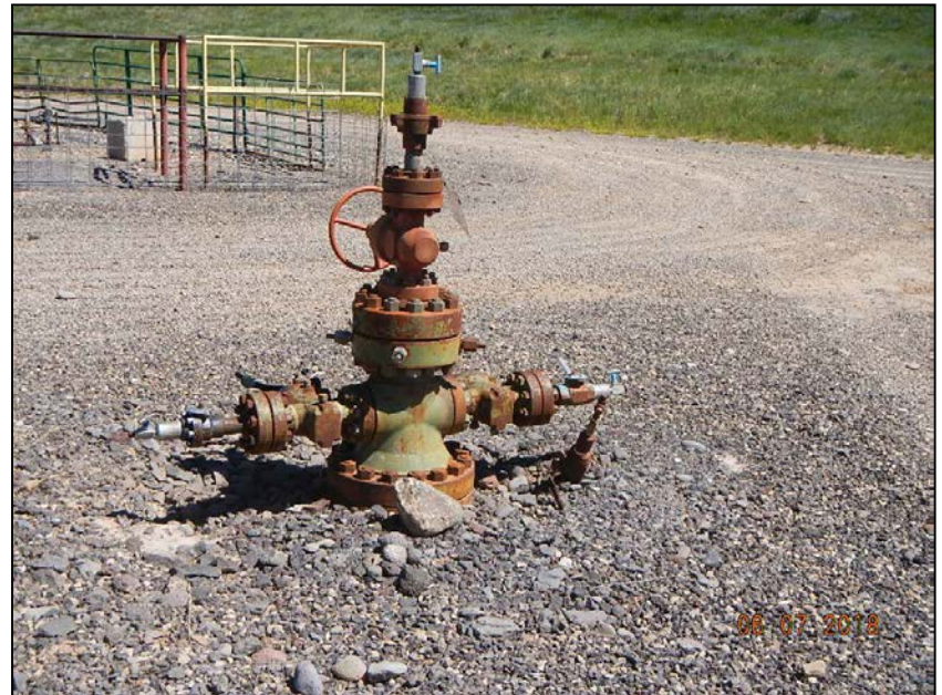
Photo 2. Well 077-08815 Temporarily Abandoned.