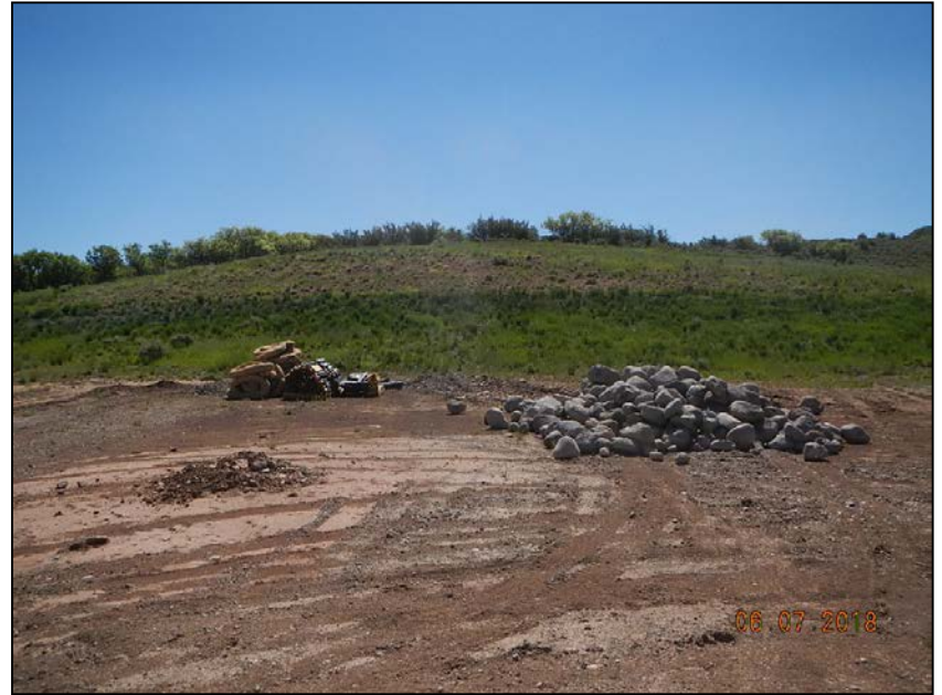
Photo 2. Stored stormwater materials.