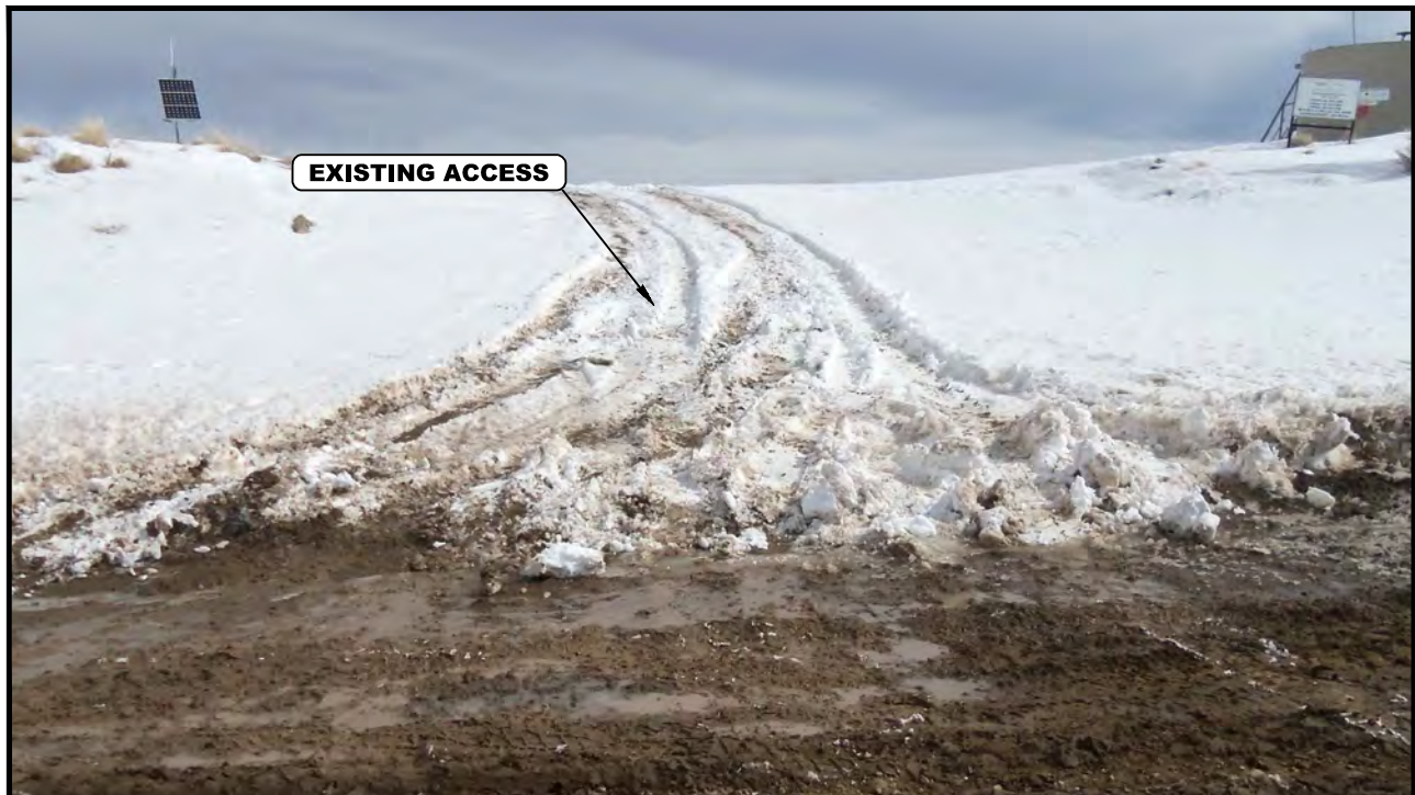
PHOTO: VIEW FROM BEGINNING OF EXISTING ACCESS