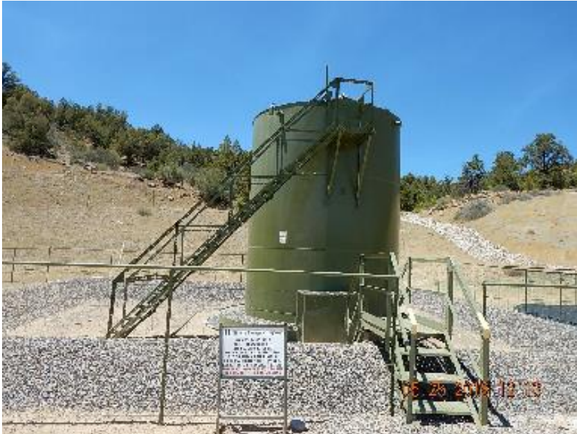
Photo 5: Installed labels are unreadable from outside containment berms.