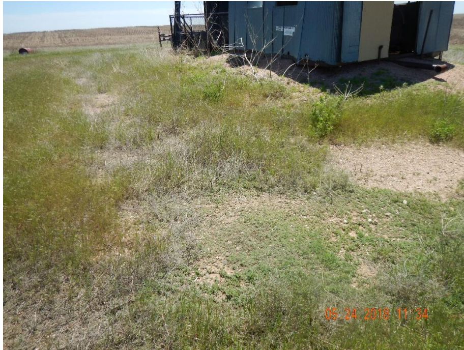
Photo 5: Photo taken from the west end of the well, facing east. Photo shows undesirable weedy plant establishment around areas of the well location