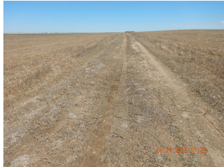
Photo 4: Photo taken from the north end of the location, facing north. Photo shows access road appears to be in good condition.