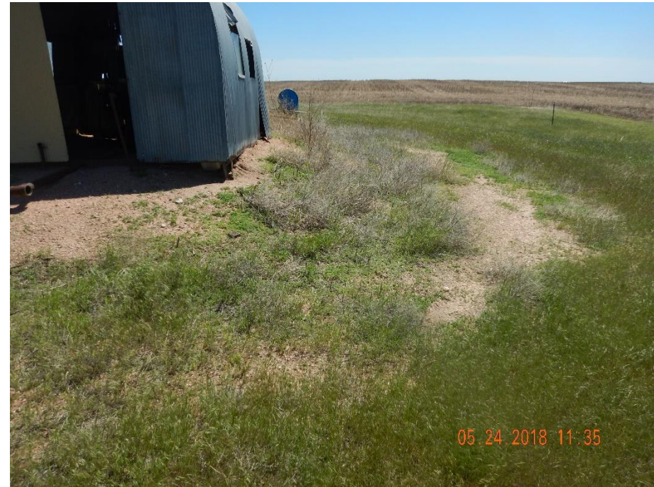
Photo 6: Photo taken from the southwest end of the well, facing east. Photo shows undesirable weedy plant establishment around areas of the well location