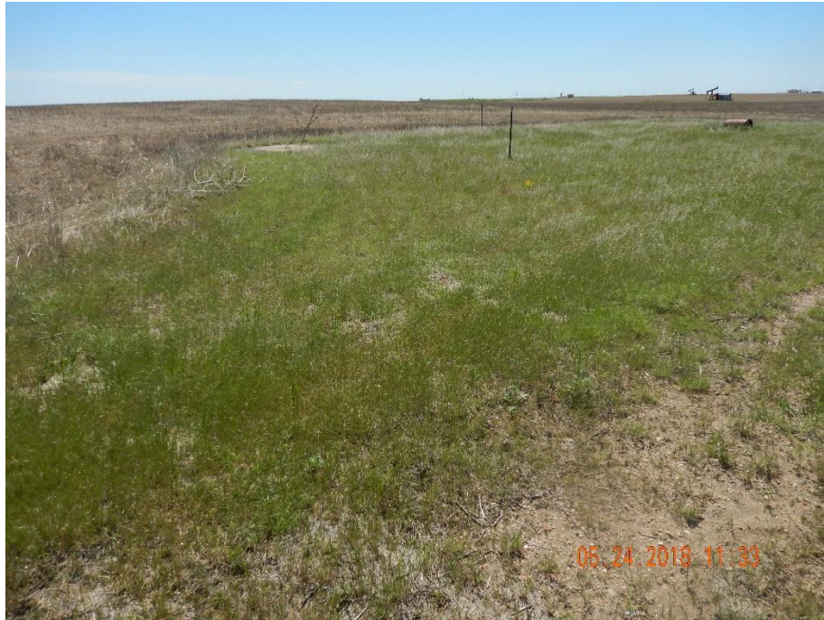
Photo 1: Photo taken from the north end of the location, facing southeast. Photos 1-3 show an overview of the location, facing southeast, to south, to north. Vegetation seen on location predominantly sand dropseed, smooth brome native forbs and cheatgrass.