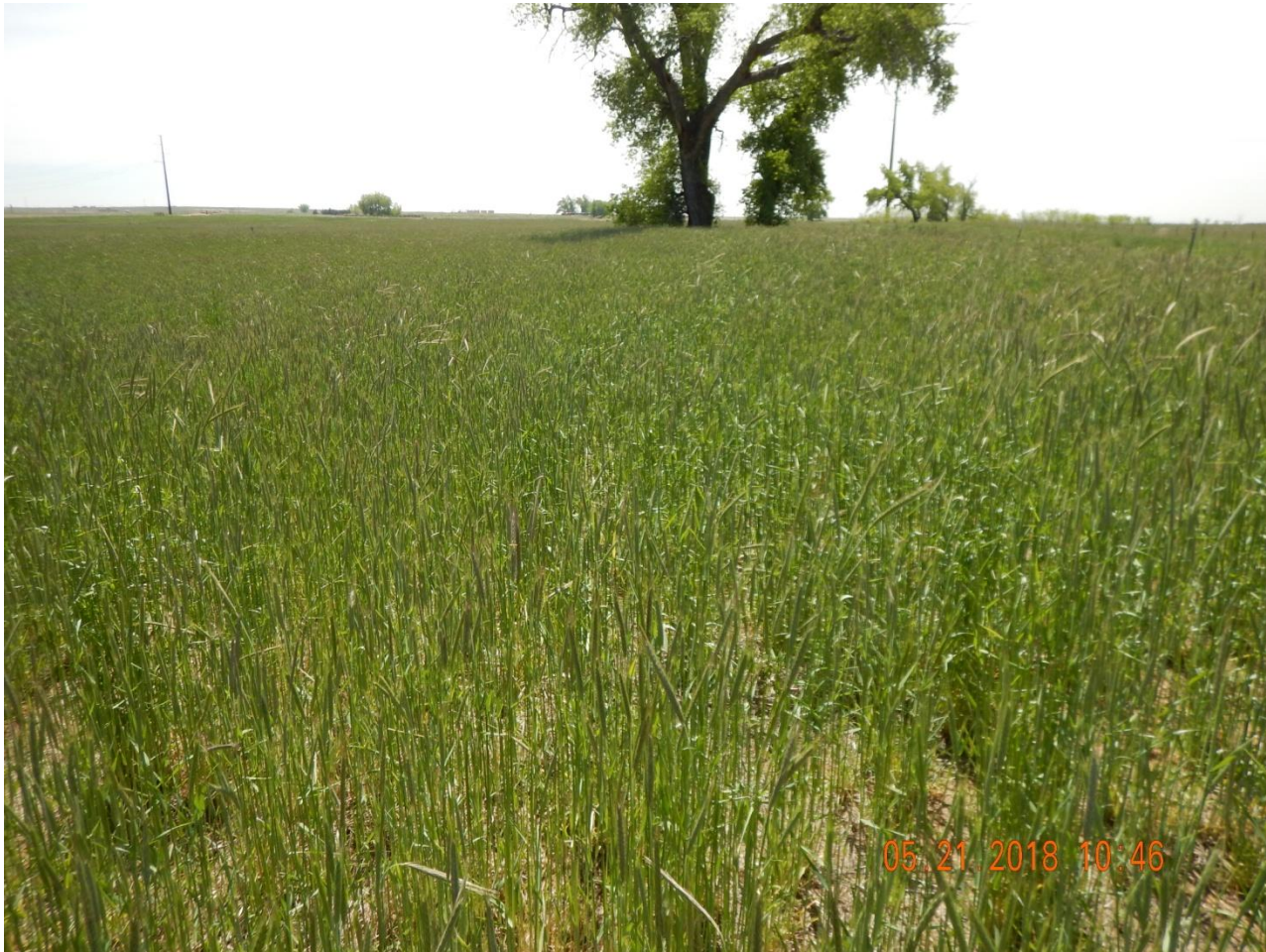
Photo 3. Photo taken from the northwestern interim area, facing South. See comments under Photo 1.