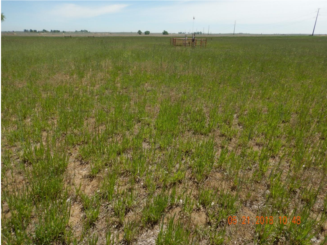
Photo 4. Photo taken west of the wells, facing East. Photo illustrates smooth brome establishment which is the desired vegetation. This is a portion of the land that was excavated from a release and topsoil was later brought in.