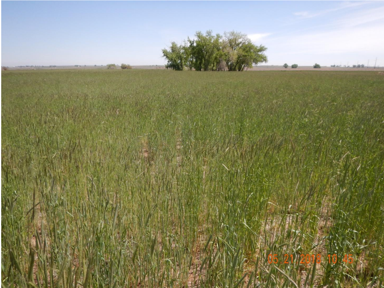
Photo 2. Photo taken from the northwestern interim area, facing East. See comments under Photo 1.