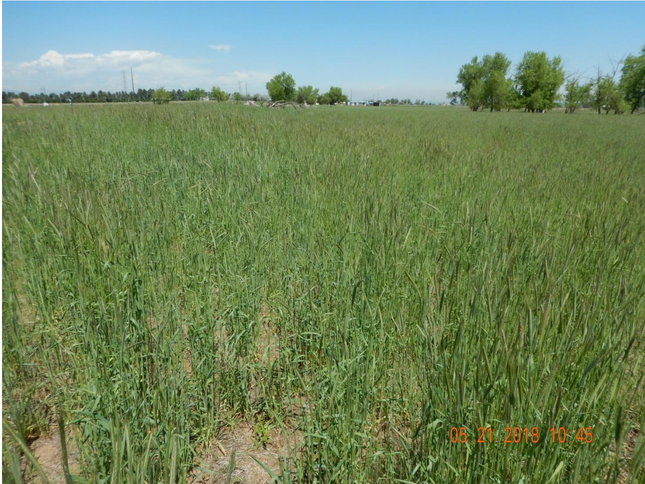
Photo 1. Photo taken from the northwestern interim area, facing North. Photo illustrates a cereal rye ( Secale cereale ) grass species that has established throughout the interim areas. Smooth brome is the desired grass species but little establishment was observed.