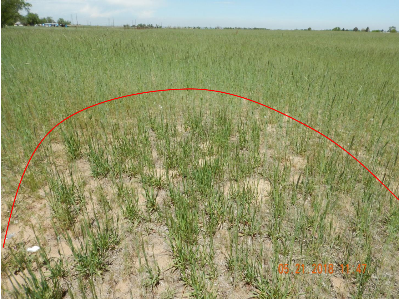
Photo 7. Photo taken north of the wells, facing North. In the foreground of the photo, it illustrates a patch of smooth brome establishment within the cereal rye.