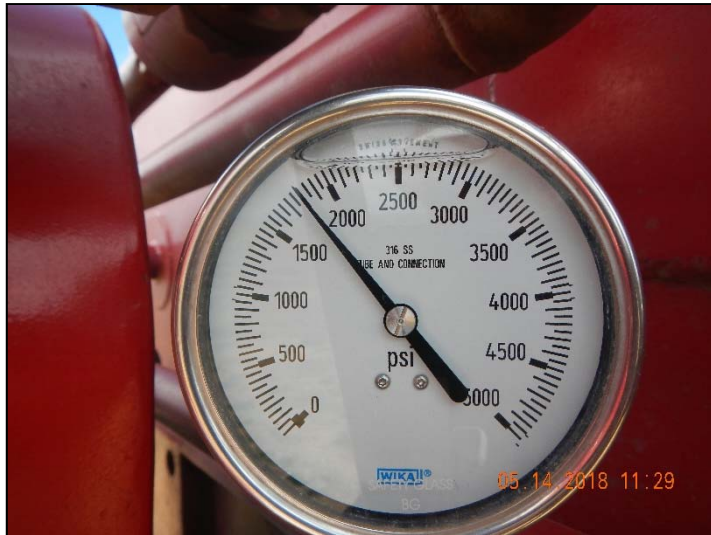
Photo 1. Casing gauge at beginning of test.