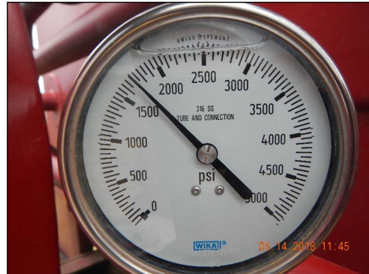
Photo 2. Casing gauge at end of test.