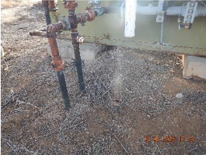
Photo 7: Unused open ended 1" steel riser E side of domestic tap equipment previous inspection.