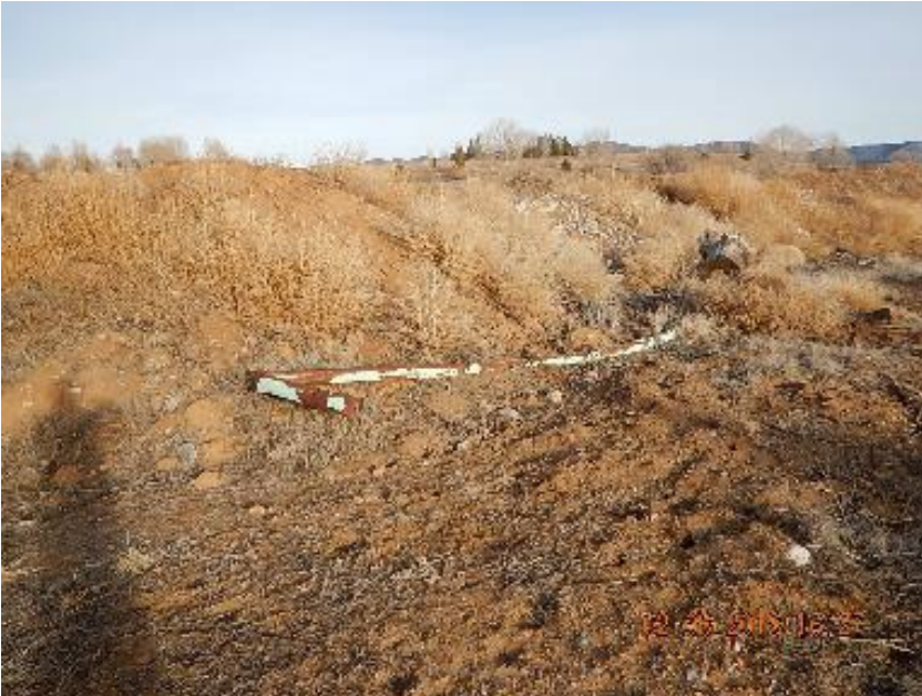
Photo 9: Section of abandoned flow line on E perimeter previous inspection.