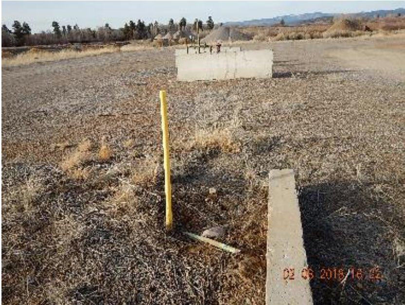
Photo 5: Open ended bent over 1" steel line S of wellhead previous inspection.