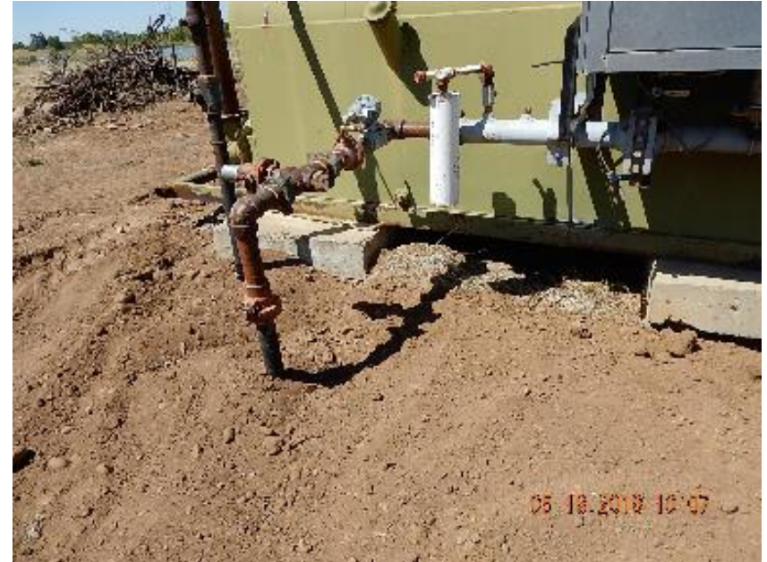
Photo 8: Abandoned/removed 1" steel riser on E side of domestic tap equipment.