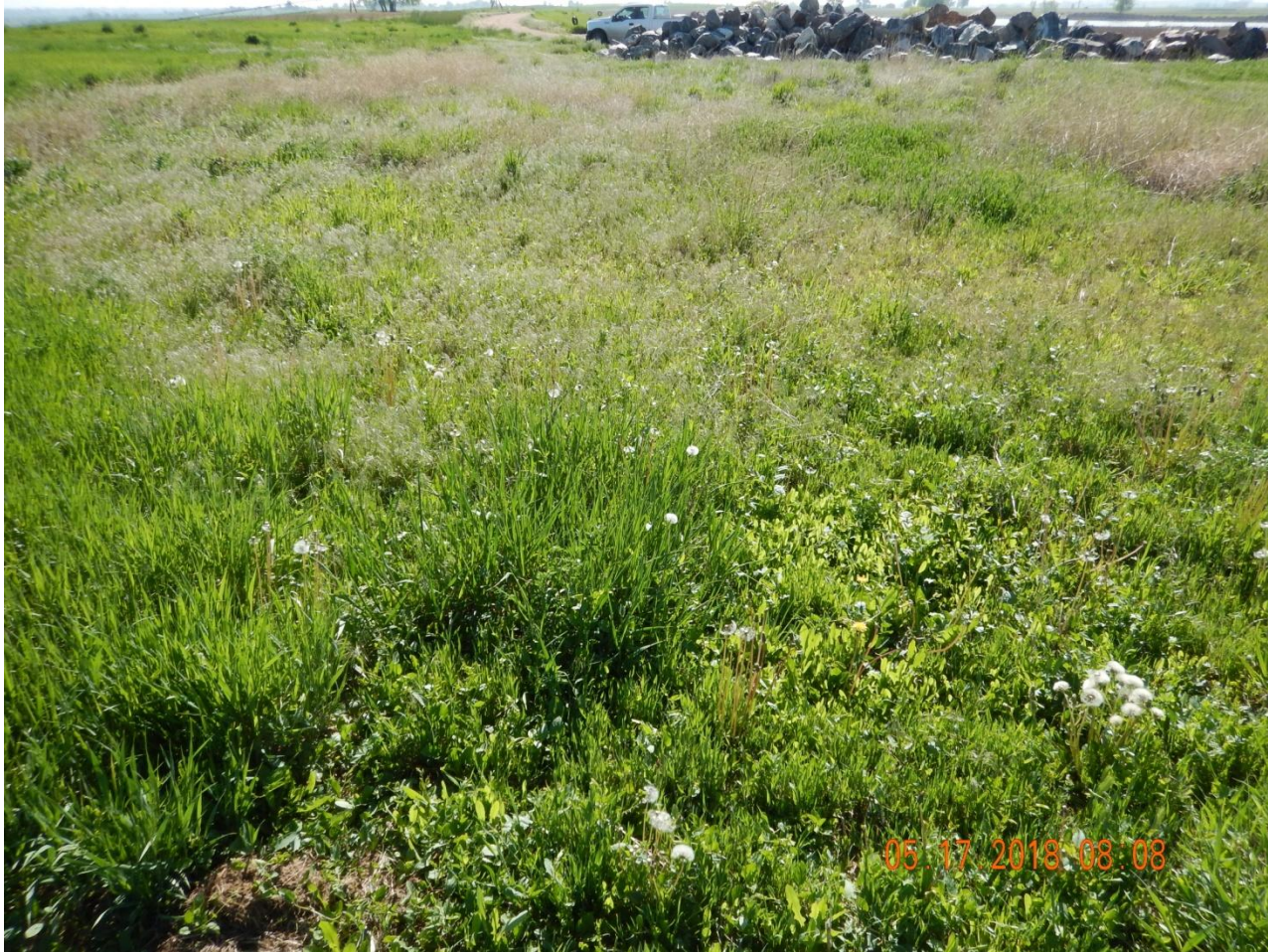
Photo 1. Photo taken from the approximate well location, facing East. Desirable vegetation was observed within the well location but several annual, weedy vegetation and noxious weeds were observed. At a minimum, Operator shall control noxious weeds and may need to perform additional reclamation activities.