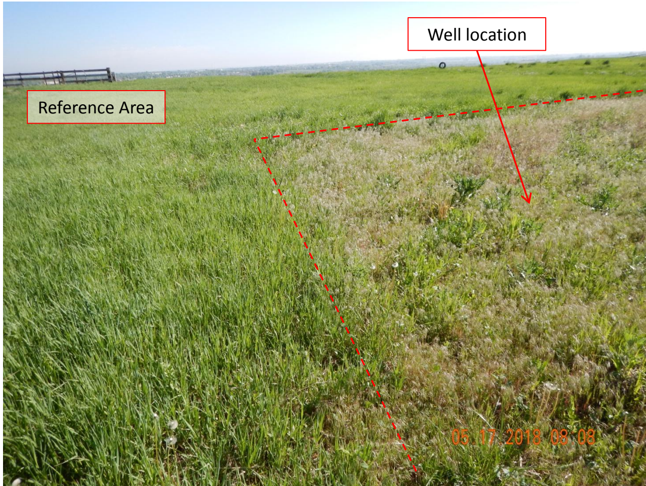
Photo 3. Photo taken from the western well location, facing North. Well location is not reflective of reference area vegetative conditions. At a minimum, Operator shall control noxious weeds and may need to perform additional reclamation activities.