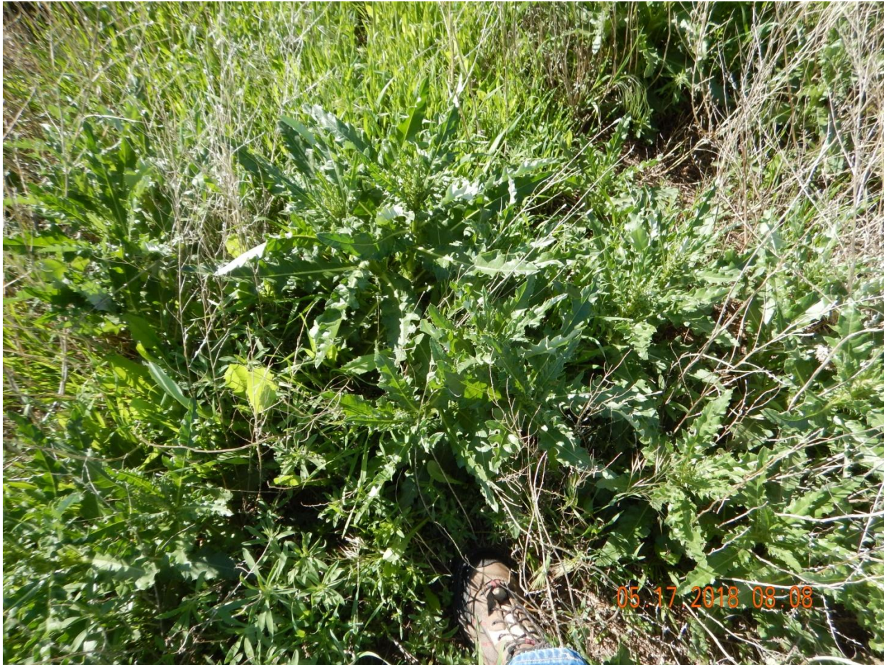
Photo 2. Photo taken from the well location, illustrating Canada thistle, List B CO Noxious weed. Operator shall control noxious weeds prior to seed set.