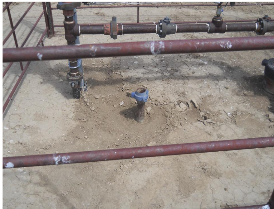
View of pipe stand for automation