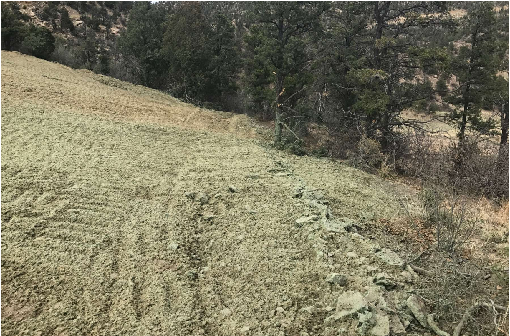
PHOTO 7: THE WELL PAD WAS RECONTOURED TO MATCH THE SURROUNDING TERRAIN. GRADING TECHNIQUES WERE INSTALLED ON THE CONTOUR TO STABILIZE THE SOIL, PROMOTE GROUND INFILTRATION AND TO PREPARE THE SOIL FOR SEEDING. THE EARTH DISTURBANCE WAS STABILIZED BY HYDRO-SEEDING USING AN APPROVED HILL RANCH SEED MIX TO PROMOTE THE ESTABLISHMENT OF VEGETATION. THESE ACTIVITIES CORRECTED THE EROSION ON THE FILL SLOPE.

GOLDEN EAGLE MINE 3N-2-95 API# 05-071-06404 – TIMBER CREEK OGCC OPERATOR NUMBER 10672 – INSPECTION DATE: MAY 07, 2018 CORRECTIVE ACTIONS COMPLETED REGARDING COGCC FIR DOCUMENT # 680102754