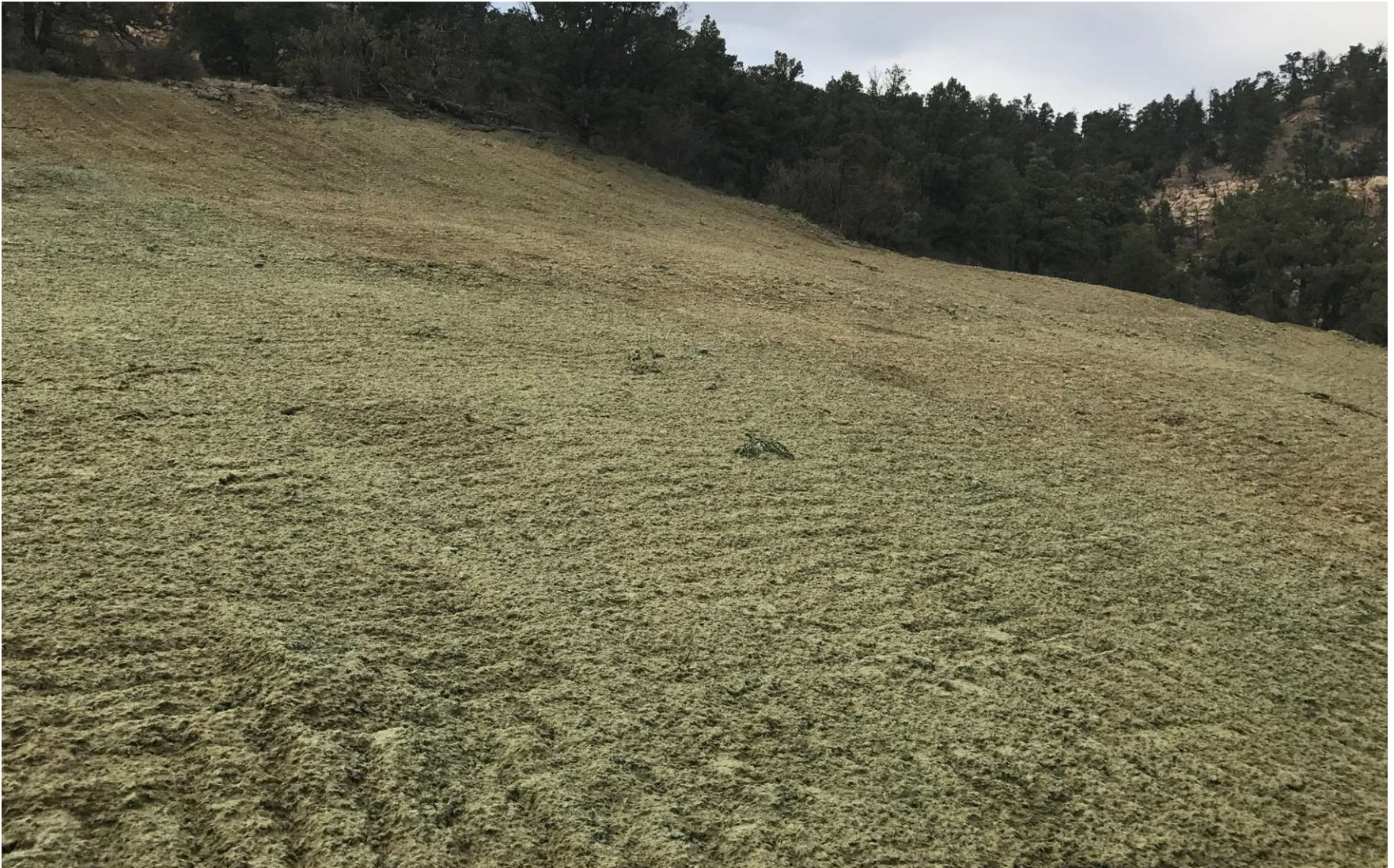
PHOTO 6: THE WELL PAD WAS RECONTOURED TO MATCH THE SURROUNDING TERRAIN. GRADING TECHNIQUES WERE INSTALLED ON THE CONTOUR TO STABILIZE THE SOIL, PROMOTE GROUND INFILTRATION AND TO PREPARE THE SOIL FOR SEEDING. THE EARTH DISTURBANCE WAS STABILIZED BY HYDRO-SEEDING USING AN APPROVED HILL RANCH SEED MIX TO PROMOTE THE ESTABLISHMENT OF VEGETATION. THESE ACTIVITIES CORRECTED THE EROSION ON THE CUT SLOPE.

GOLDEN EAGLE MINE 3N-2-95 API# 05-071-06404 – TIMBER CREEK OGCC OPERATOR NUMBER 10672 – INSPECTION DATE: MAY 07, 2018 CORRECTIVE ACTIONS COMPLETED REGARDING COGCC FIR DOCUMENT # 680102754