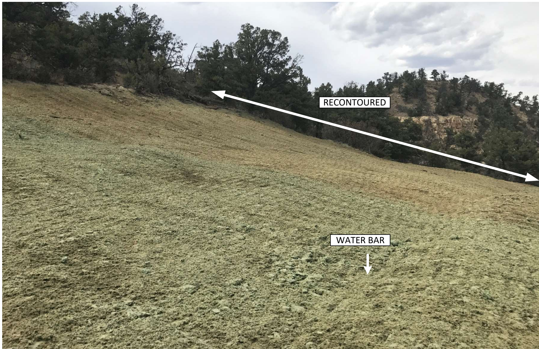
PHOTO 1: OVERVIEW OF LOCATION TO NORTH. THE WELL PAD WAS RECONTOURED TO MATCH THE SURROUNDING TERRAIN, THIS PROVIDES SOIL DECOMPACTION. GRADING TECHNIQUES WERE INSTALLED ON THE CONTOUR TO PROVIDE SOIL STABILIZATION, PROMOTE GROUND INFILTRATION AND PREPARES THE SOIL FOR SEEDING. (1) WATER BAR INSTALLED ACROSS THE RECLAMATION TO SLOW RUN OFF VELOCITY. THE EARTH DISTURBANCE WAS STABILIZED BY HYDRO-SEEDING USING AN APPROVED HILL RANCH SEED MIX TO PROMOTE THE ESTABLISHMENT OF VEGETATION. THE LOCATION SIGN HAS BEEN REMOVED FROM LOCATION.

GOLDEN EAGLE MINE 3N-2-95 API# 05-071-06404 – TIMBER CREEK OGCC OPERATOR NUMBER 10672 – INSPECTION DATE: MAY 07, 2018 CORRECTIVE ACTIONS COMPLETED REGARDING COGCC FIR DOCUMENT # 680102754