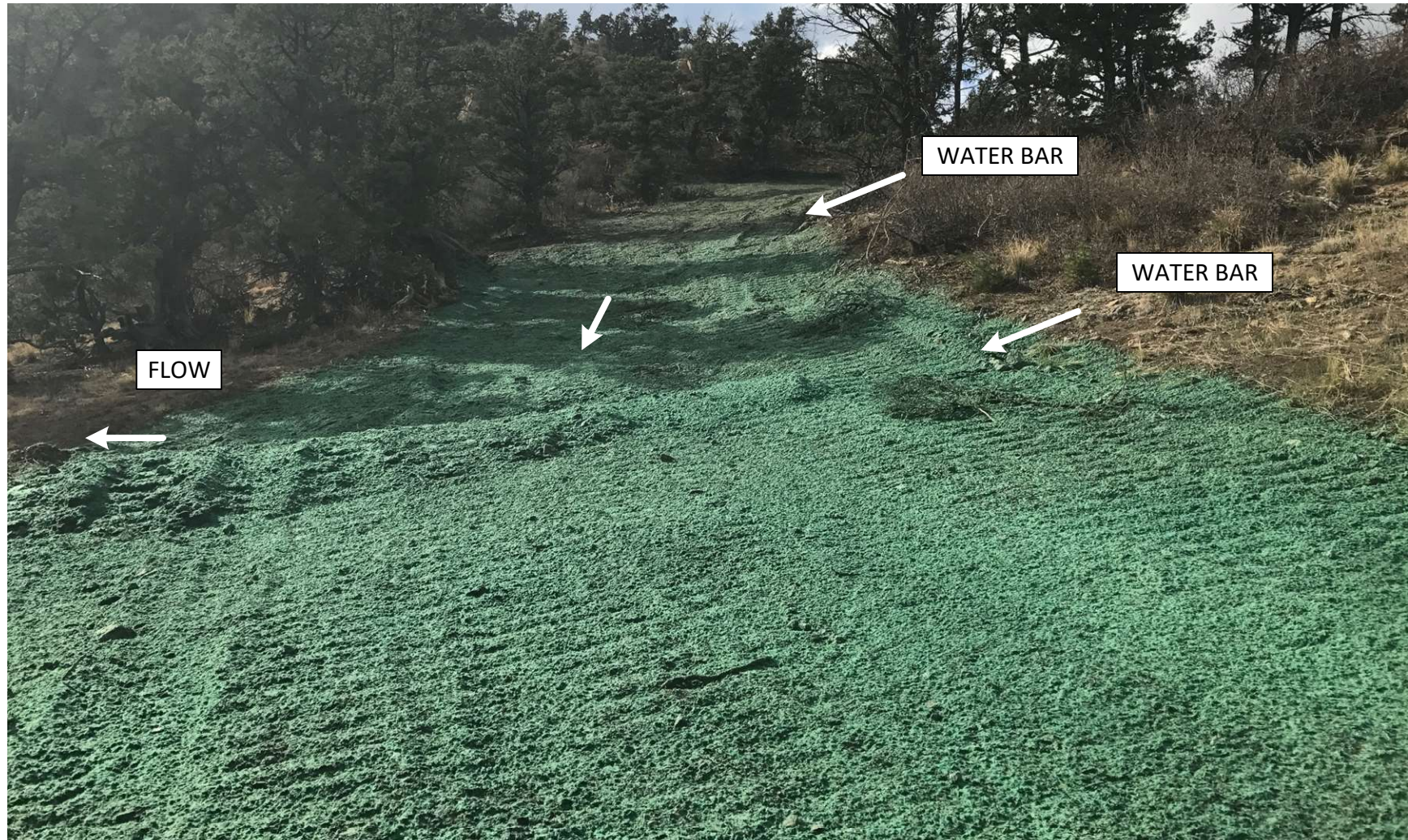
PHOTO 4: THE ACCESS ROAD WAS RECONTOURED TO MATCH THE SURROUNDING TERRAIN, THIS PROVIDES SOIL DECOMPACTION AND CORRECTED THE EROSION RILL. (2) WATER BARS WERE INSTALLED TO REDUCE VELOCITY FROM RUN OFF. GRADING TECHNIQUES WERE INSTALLED ON THE CONTOUR TO STABILIZE THE SOIL, PROMOTE GROUND INFILTRATION AND PREPARES THE SOIL FOR SEEDING. THE EARTH DISTURBANCE WAS STABILIZED BY HYDRO-SEEDING USING AN APPROVED HILL RANCH SEED MIX TO PROMOTE THE ESTABLISHMENT OF VEGETATION.

GOLDEN EAGLE MINE 3N-2-95 API# 05-071-06404 – TIMBER CREEK OGCC OPERATOR NUMBER 10672 – INSPECTION DATE: MAY 08, 2018 CORRECTIVE ACTIONS COMPLETED REGARDING COGCC FIR DOCUMENT # 680102754