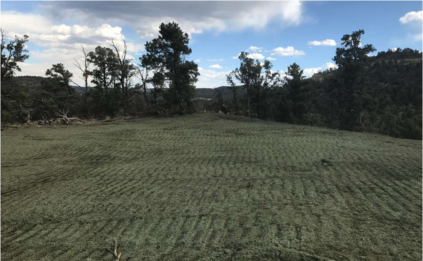
PHOTO 2: THE TOP SOIL STOCKPILE WAS USED DURING RECLAMATION ACTIVITIES. THE TOP SOIL SIGN AND POST WERE REMOVED FROM LOCATION.

GOLDEN EAGLE MINE 3N-2-95 API# 05-071-06404 – TIMBER CREEK OGCC OPERATOR NUMBER 10672 – INSPECTION DATE: MAY 08, 2018 CORRECTIVE ACTIONS COMPLETED REGARDING COGCC FIR DOCUMENT # 680102754