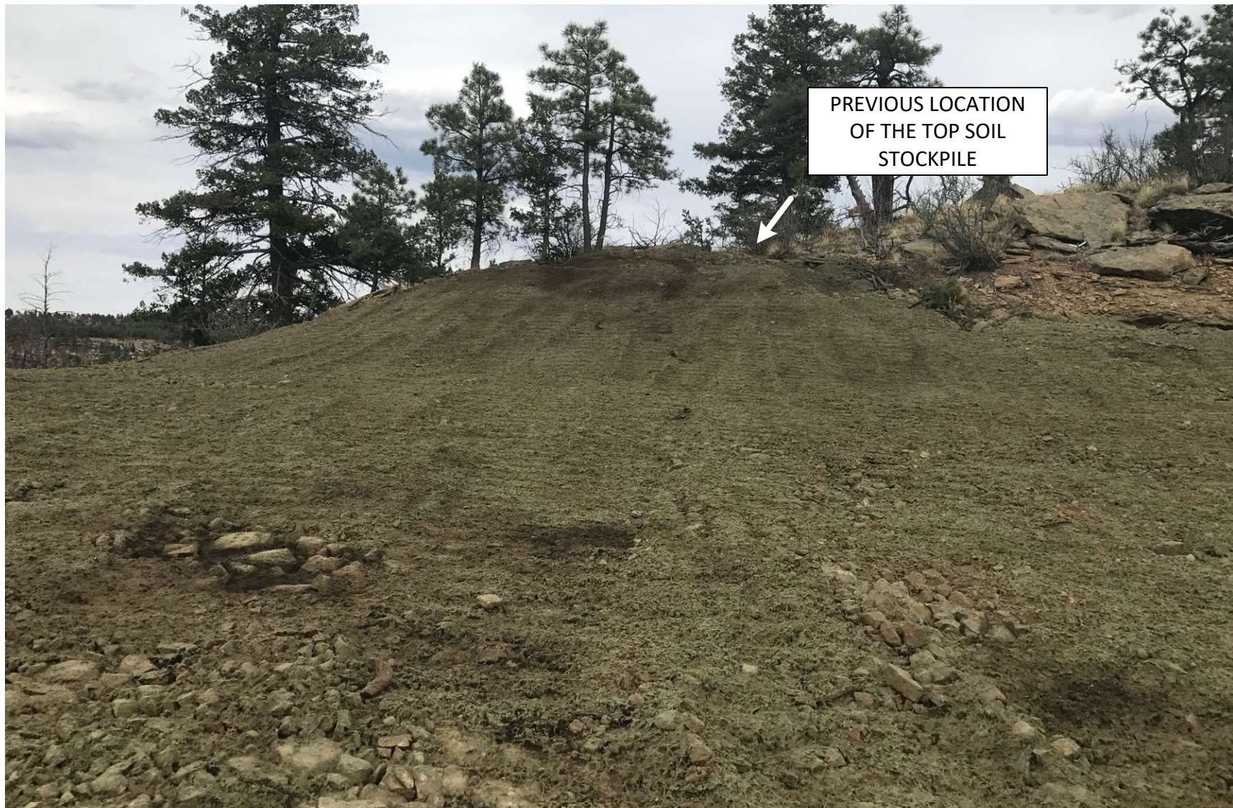
PHOTO 4: THE TOP SOIL STOCKPILE WAS SPREAD ACROSS LOCATION DURING THE RECLAMATION ACTIVITIES. THE SIGNAGE WAS REMOVED FROM LOCATION.

GOLDEN EAGLE MINE NW-3-3-95 API# 05-071-06397 – TIMBER CREEK OGCC OPERATOR NUMBER 10672 – INSPECTION DATE: MAY 07, 2018 CORRECTIVE ACTIONS COMPLETED REGARDING COGCC FIR DOCUMENT # 680102767