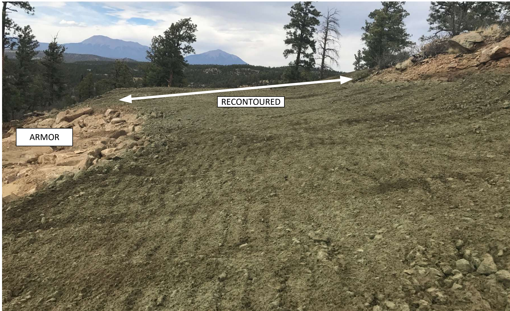
PHOTO 1: OVERVIEW OF LOCATION TO NORTH. THE WELL PAD AND ACCESS ROAD WERE RECONTOURED TO MATCH THE SURROUNDING TERRAIN, THIS PROVIDES SOIL DECOMPACTION. THE ROCK ON THE FILL SLOPE WAS PULLED UP TO STABILIZE THE SLOPE. GRADING TECHNIQUES WERE INSTALLED ON THE CONTOUR TO PROVIDE SOIL STABILIZATION, PROMOTE GROUND INFILTRATION AND TO PREPARE THE SOIL FOR SEEDING. THE EARTH DISTURBANCE ON THE WELL PAD WAS STABILIZED BY HYDRO-SEEDING USING AN APPROVED HILL RANCH SEED MIX TO PROMOTE THE ESTABLISHMENT OF VEGETATION.

GOLDEN EAGLE MINE NW-3-3-95 API# 05-071-06397 – TIMBER CREEK OGCC OPERATOR NUMBER 10672 – INSPECTION DATE: MAY 07, 2018 CORRECTIVE ACTIONS COMPLETED REGARDING COGCC FIR DOCUMENT # 680102767