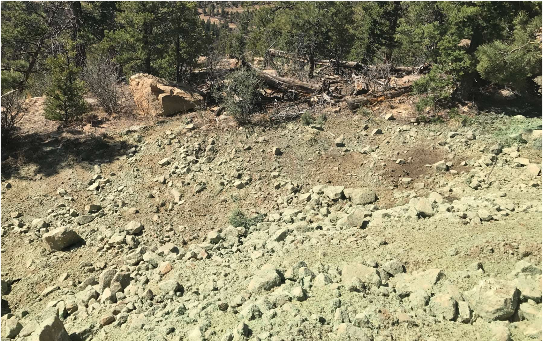
PHOTO 5: THE SILT FENCE AT THE BASE OF THE FILL SLOPE HAS BEEN REMOVED.

GOLDEN EAGLE MINE NW-3-3-95 API# 05-071-06397 – TIMBER CREEK OGCC OPERATOR NUMBER 10672 – INSPECTION DATE: MAY 08, 2018 CORRECTIVE ACTIONS COMPLETED REGARDING COGCC FIR DOCUMENT # 680102767