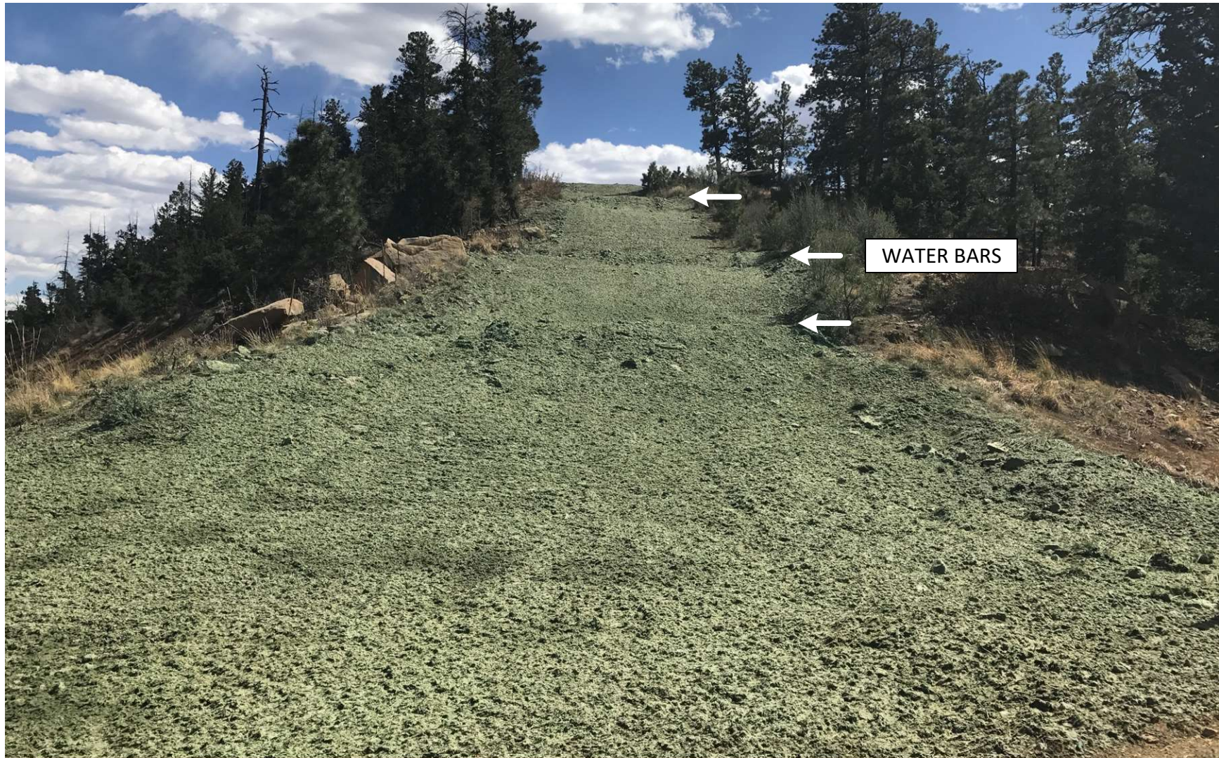
PHOTO 7: NORTH OF LOCATION ON THE MAIN ROAD FACING THE PIPELIN R.O.W. RECLAMATION. (3) WATER BARS WERE INSTALLED TO REDUCE RUN OFF VELOCITY. THE EARTH DISTURBANCE WAS STABILIZED BY HYDRO-SEEDING USING AN APPROVED HILL RANCH SEED MIX TO PROMOTE THE ESTABLISHMENT OF VEGETATION.

GOLDEN EAGLE MINE NW-3-3-95 API# 05-071-06397 – TIMBER CREEK OGCC OPERATOR NUMBER 10672 – INSPECTION DATE: MAY 08, 2018 CORRECTIVE ACTIONS COMPLETED REGARDING COGCC FIR DOCUMENT # 680102767