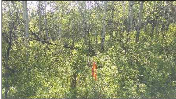
REFERENCE AREA LOOKING NORTH 6/2/2017