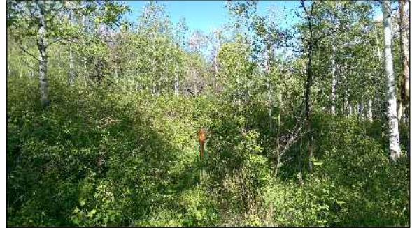
REFERENCE AREA LOOKING SOUTH 6/2/2017