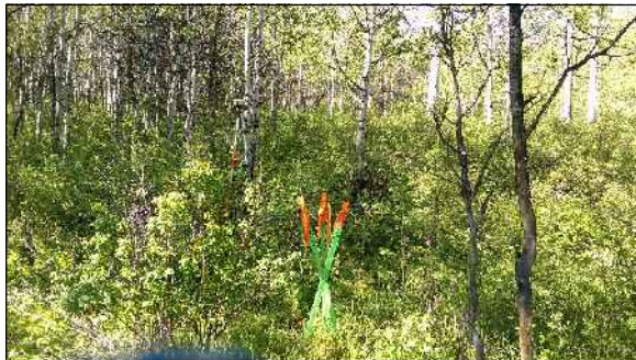
REFERENCE AREA LOOKING EAST 6/2/2017