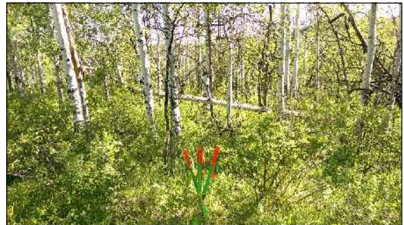
REFERENCE AREA LOOKING WEST 6/2/2017

REFERENCE AREA CENTER STAKE (DO NOT DISTURB) LATITUDE (NAD 83) NORTH 39.245805 DEG. LONGITUDE (NAD 83) WEST 107.717081 DEG.