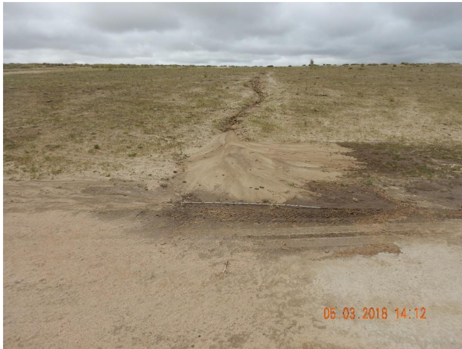
Photo 7: Photo taken from the west end of the location, facing north. Photo shows stormwater erosion degradation resulting in sediment transport from the interim areas onto the location. 6 foot measuring stick for reference.