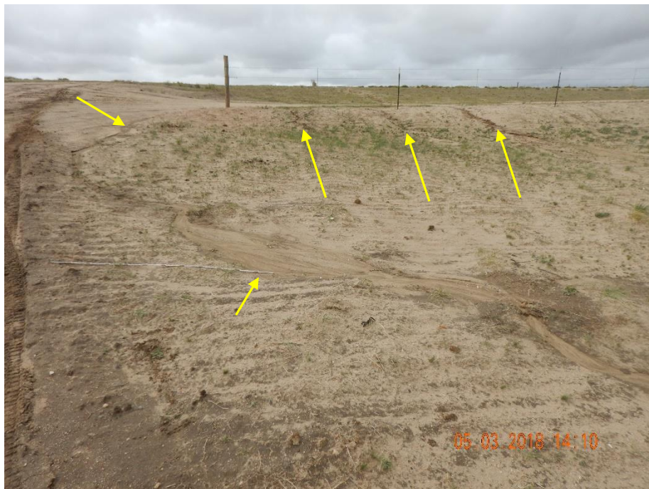
Photo 3: Photo taken from the southwest end of the location, facing north. Photo shows stormwater erosion degradation resulting in sediment transport from location and access road onto the interim areas.