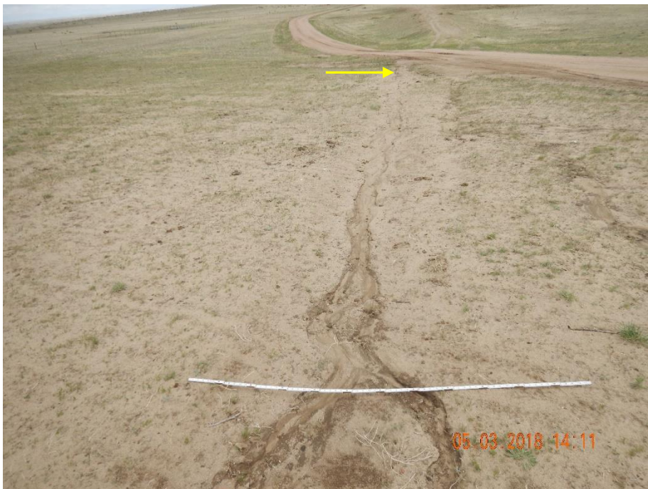
Photo 5: Photo taken from the interim areas south of the location, facing south. Photo shows stormwater erosion degradation resulting in sediment transport from location onto the interim areas. 6 foot measuring stick for reference