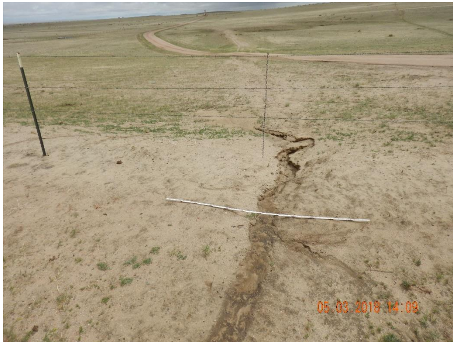
Photo 1: Photo taken from the southwest end of the location, facing south. Photo shows stormwater erosion degradation resulting in sediment transport from location onto the interim areas. 6 foot measuring stick for reference.