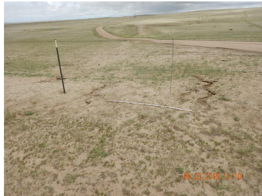
Photo 2: Photo taken from the southwest end of the location, facing south. Photo shows stormwater erosion degradation resulting in sediment transport from location onto the interim areas. 6 foot measuring stick for reference.