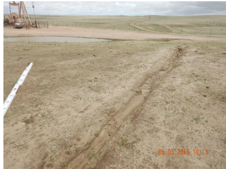
Photo 8: Photo taken from the interim areas on the northwest end of the location, facing south. Photo shows stormwater erosion degradation resulting in sediment transport from the interim areas onto the location.