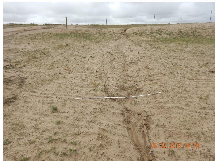
Photo 4: Photo taken from the interim areas south of the location, facing north. Photo shows stormwater erosion degradation resulting in sediment transport from location onto the interim areas. 6 foot measuring stick for reference