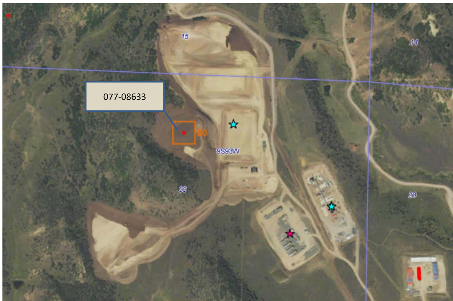
Photo#2: 2015 aerial view of AL Well API# 077- 08633 and Laramie Loc#425510