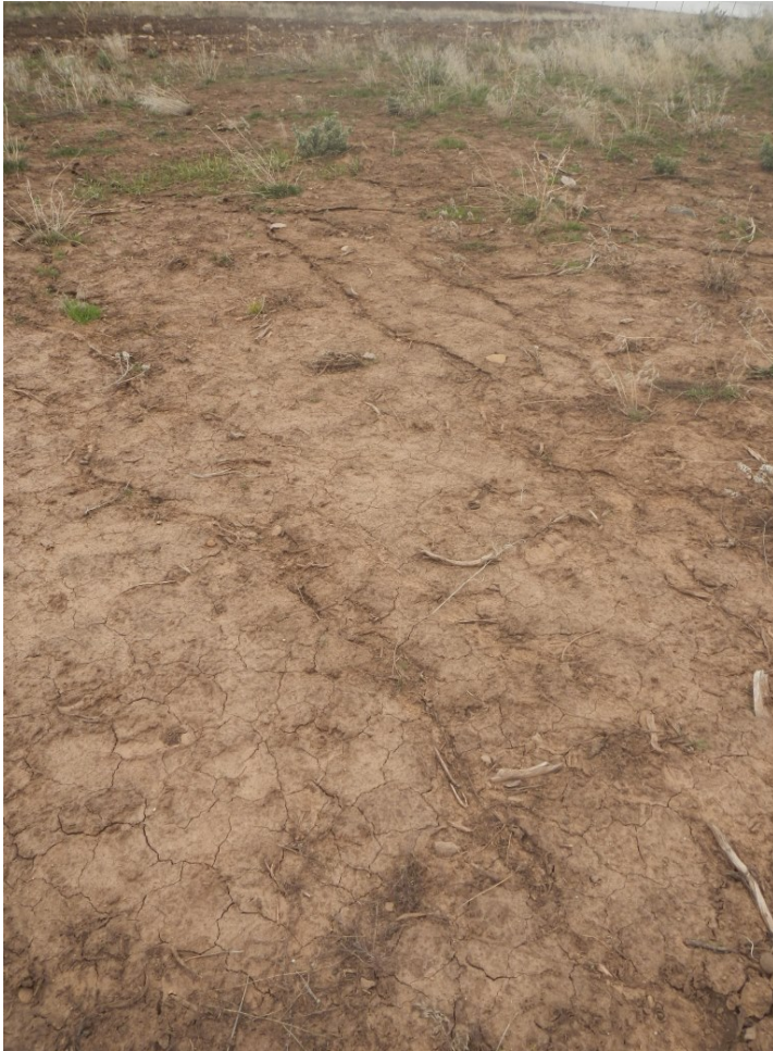
Photo#6: Areas of site are bare of vegetation or are infested with weedy species.