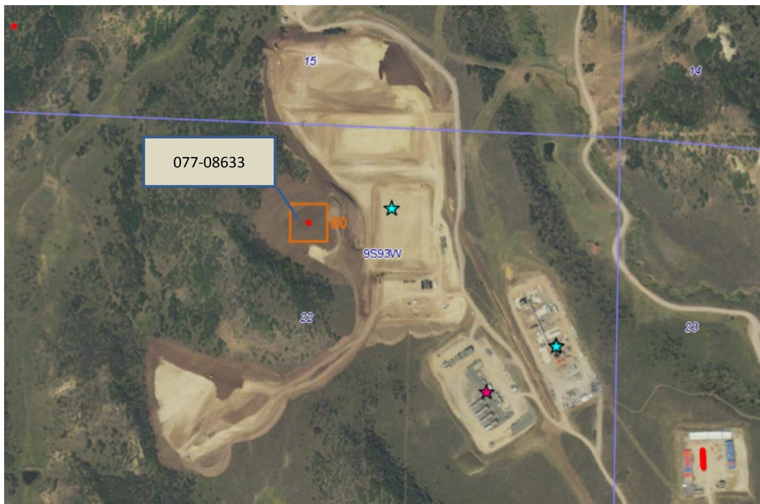
Photo#2: 2015 aerial view of Well API# 077- 08633