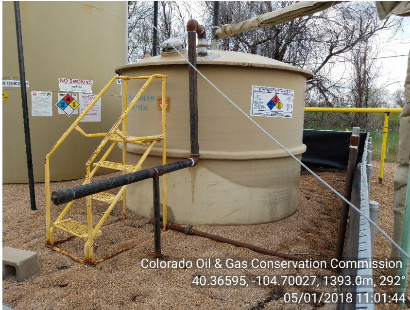
Colorado Oil & Gas Conservation Commission 40.36595, -104.70027, 1393.0m, 292° 05/01/2018 11:01:44

Produced Water Tank Corrective Action: Equipment not anchored or inadequately anchored