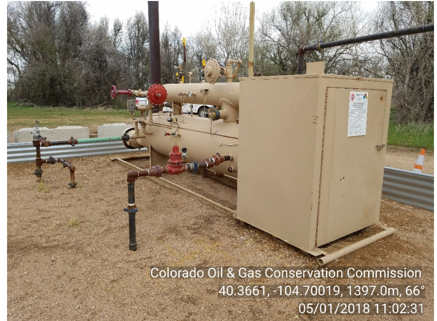
Colorado Oil & Gas Conservation Commission 40.3661, -104.70019, 1397.0m, 66° 05/01/2018 11:02:31

Produced Water Tank Corrective Action: Equipment not anchored or inadequately anchored