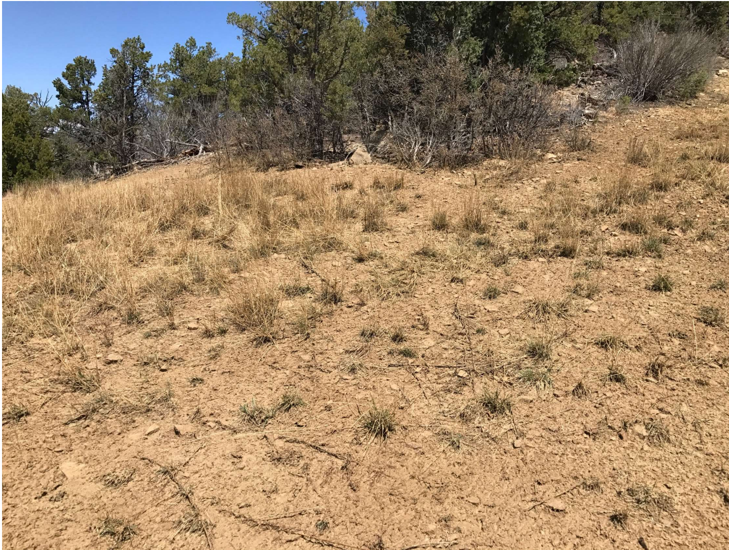
PHOTO 3: THE LOCATION AND ACCESS ROAD RECLAMATION WERE RESEEDING WITH HYDRO-MULCH USING AN APPROVED HILL RANCH SEED MIX FOR SOIL STABILIZATION AND TO PROMOTE THE ESTABLISHMENT OF VEGETATION.

GOLDEN EAGLE MINE GE -72-93 API# 05-071-06456– TIMBER CREEK OGCC OPERATOR NUMBER 10672 – INSPECTION DATE: APRIL 30, 2018 CORRECTIVE ACTIONS COMPLETED REGARDING COGCC FIR DOCUMENT # 680102766