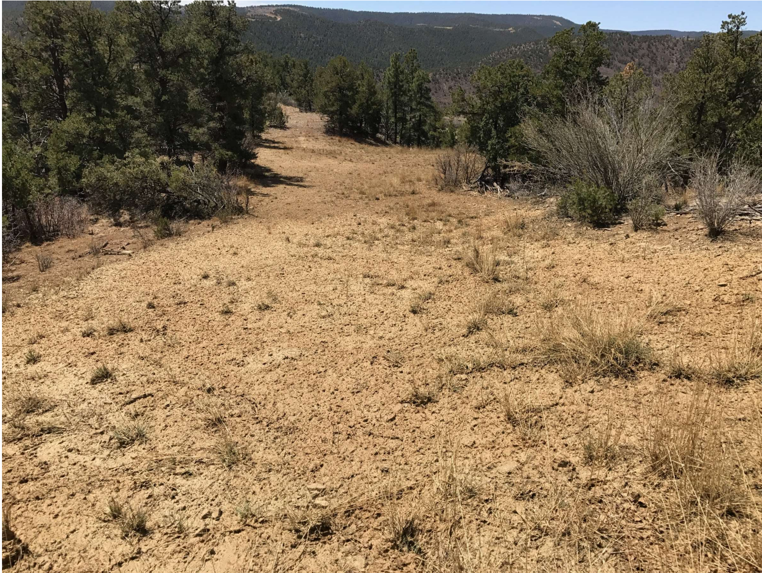
PHOTO 2:THE LOCATION AND ACCESS ROAD RECLAMATION WERE RESEEDED WITH HYDRO-MULCH USING AN APPROVED HILL RANCH SEED MIX FOR SOIL STABILIZATION AND TO PROMOTE THE ESTABLISHMENT OF VEGETATION.

GOLDEN EAGLE MINE GE -72-93 API# 05-071-06456– TIMBER CREEK OGCC OPERATOR NUMBER 10672 – INSPECTION DATE: APRIL 30, 2018 CORRECTIVE ACTIONS COMPLETED REGARDING COGCC FIR DOCUMENT # 680102766