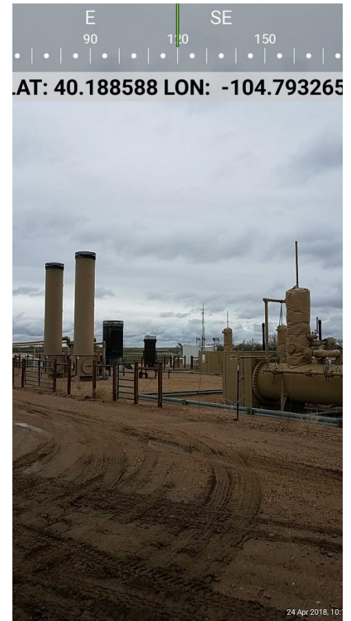
Photo 6 Production Equipment