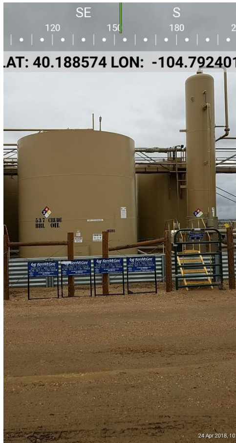
Photo 4 Battery Signage

Location Name: Sarchet #37N-32HZ Location Number: 428936 API #: 05-123-35591