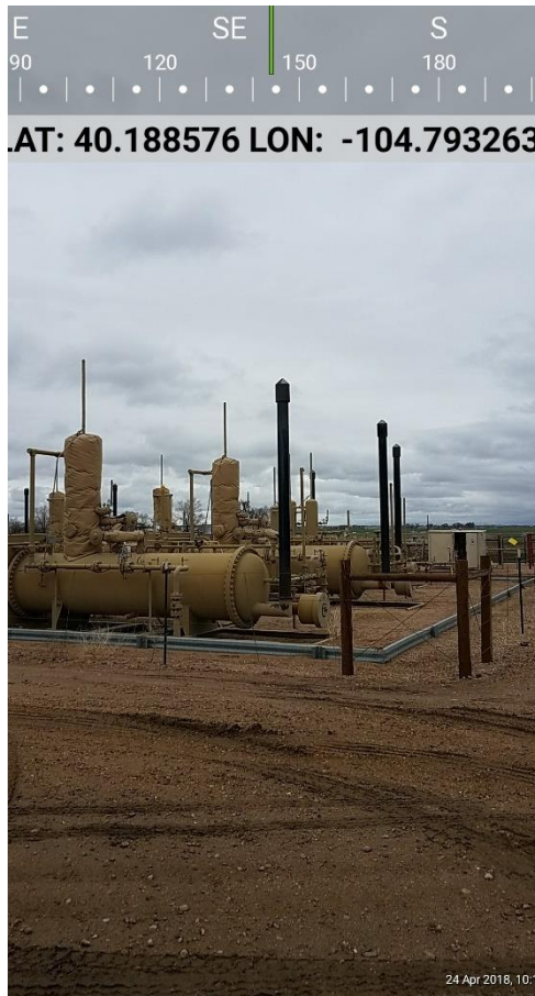
Photo 7 Production Equipment

Location Name: Sarchet #37N-32HZ Location Number: 428936 API #: 05-123-35591