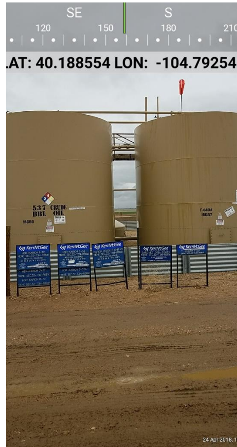
Photo 5 Battery Signage