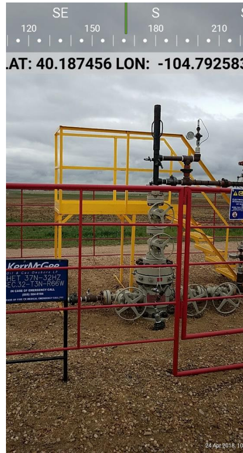
Photo 2 Sarchet 37N-32Hz