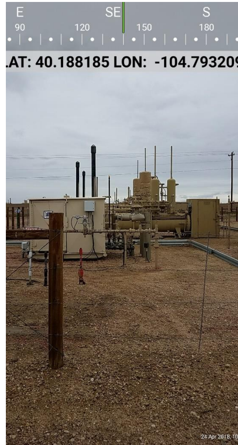
Photo 8 Gas Meter Runs