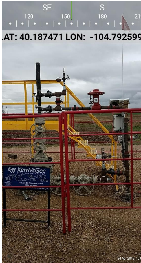
Photo 1 Sarchet 16N-32Hz

Location Name: Sarchet #37N-32HZ Location Number: 428936 API #: 05-123-35591