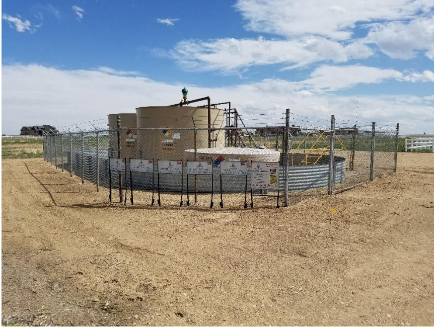
Photo 1. Location sign