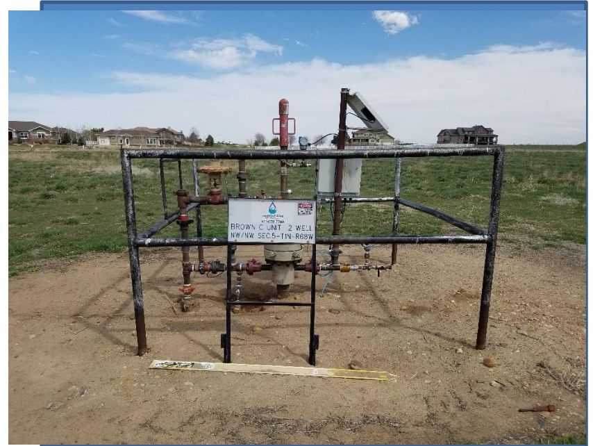
Photo 2. Wellhead