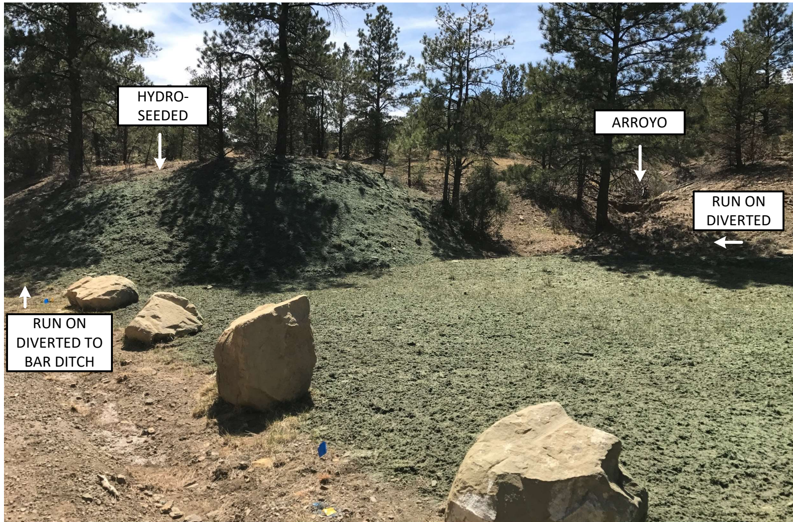
PHOTO 3: FACING SOUTHWEST TOWARD THE GOLDEN EAGLE MINE 40-89 PAD RECLAMATION. THE RUN ON FROM THE SECOND ARROYO IS DIVERTED AROUND THE PAD AND INTO THE EXISTING BAR DITCH ON THE LEASE ROAD. THE SITE WAS HYDRO-SEEDED USING AN APPROVED HILL RANCH SEED MIX TO PROMOTE THE ESTABLISHMENT OF VEGETATION.

GOLDEN EAGLE MINE 40-89 API# 05-071-06475 – TIMBER CREEK OGCC OPERATOR NUMBER 10672 – INSPECTION DATE: APRIL 19, 2018 CORRECTIVE ACTIONS COMPLETED REGARDING COGCC FIR DOCUMENT # 680102764