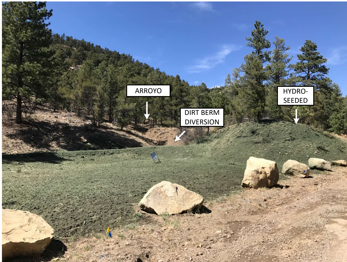
PHOTO 1: FACING NORTHWEST TOWARD THE GOLDEN EAGLE MINE 40-89 PAD RECLAMATION. THE DIRT BERM DIVERSION WAS DOMINATED TO DIRECT THE RUN ON FROM THE ARROYO AWAY FROM THE RECLAMATION AREA. THE SITE WAS HYDRO-SEEDED USING AN APPROVED HILL RANCH SEED MIX TO PROMOTE THE ESTABLISHMENT OF VEGETATION.

GOLDEN EAGLE MINE 40-89 API# 05-071-06475 – TIMBER CREEK OGCC OPERATOR NUMBER 10672 – INSPECTION DATE: APRIL 19, 2018 CORRECTIVE ACTIONS COMPLETED REGARDING COGCC FIR DOCUMENT # 680102764