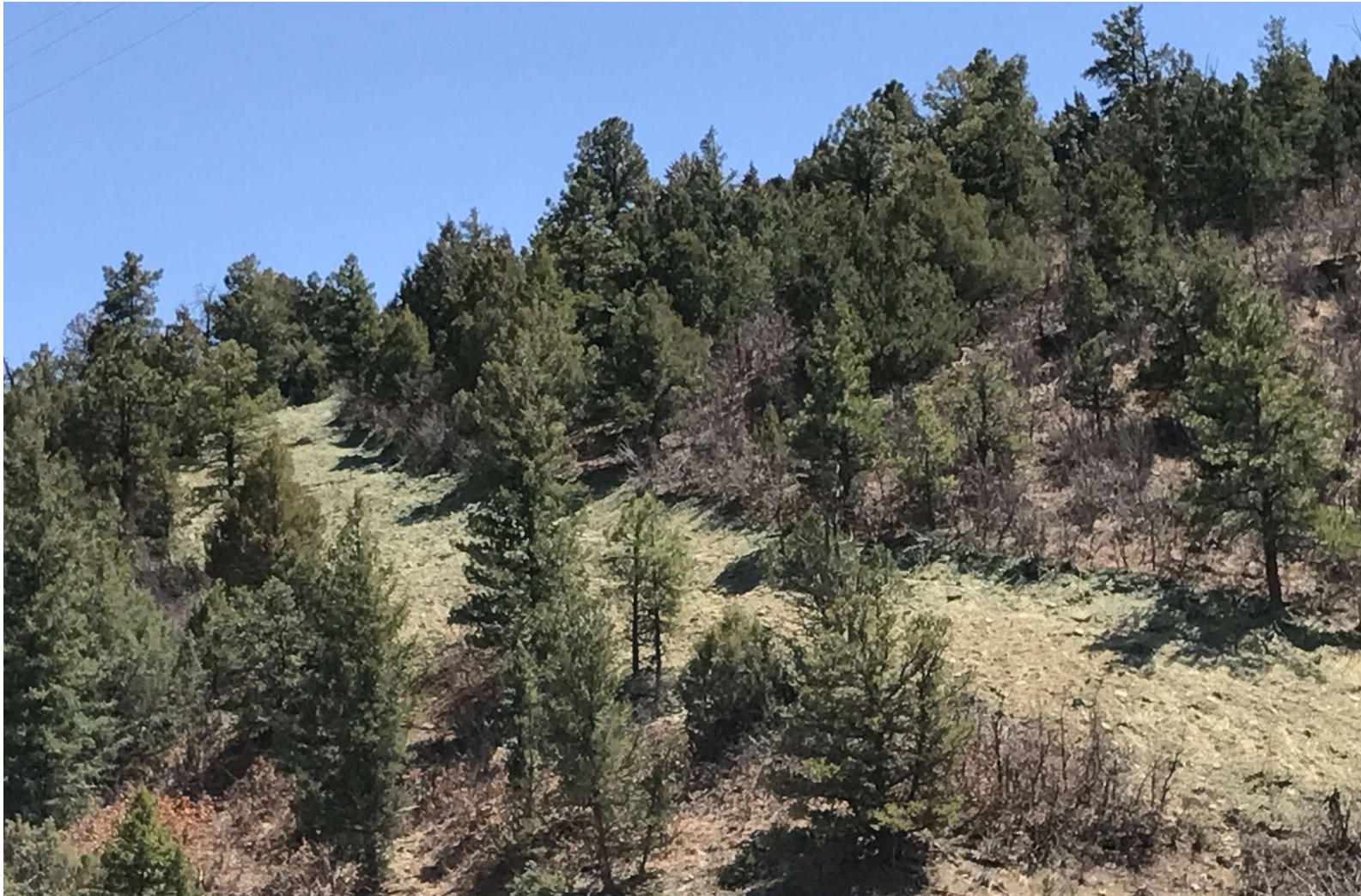
PHOTO 5: FACING SOUTHEAST FROM RAIL LINE, THE ACCESS ROAD TO GOLDEN EAGLE MINE E-1A PAD WAS RECONTOURED TO MATCH THE SURROUNDING TERRAIN. GRADING TECHNIQUES WERE INSTALLED ON THE CONTOUR. (4) WATER BARS WERE INSTALLED TO DIVERT WATER OFF THE R.O.W. THE EARTH DISTURBANCE WAS HYDRO-SEEDING WITH AN APPROVED COLORADO PARKS AND WILDLIFE (CPW) SEED MIX TO PROMOTE THE ESTABLISHMENT OF VEGETATION.

GOLDEN EAGLE MINE E-1A API# 05-071-06411 – TIMBER CREEK OGCC OPERATOR NUMBER 10672 – INSPECTION DATE: APRIL 19, 2018 CORRECTIVE ACTIONS COMPLETED REGARDING COGCC FIR DOCUMENT # 680102745