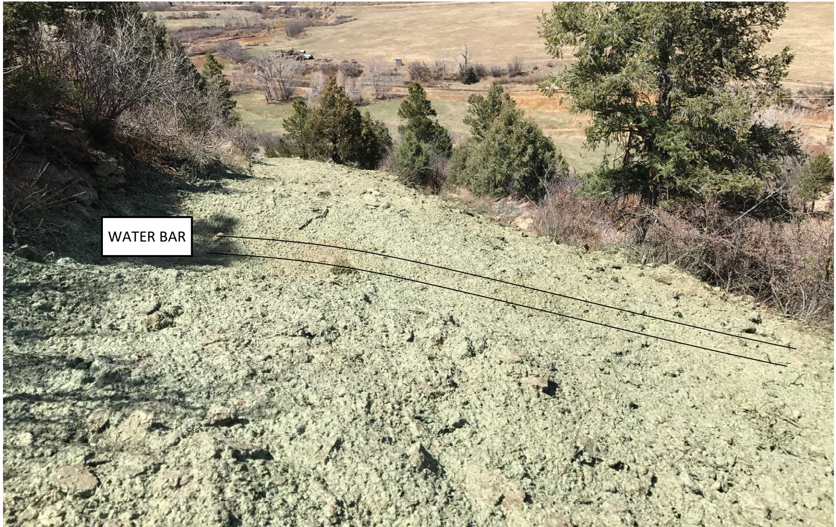
PHOTO 4: FACING NORTHWEST, THE ACCESS ROAD TO GOLDEN EAGLE MINE E-1A PAD WAS RECONTOURED TO MATCH THE SURROUNDING TERRAIN. GRADING TECHNIQUES WERE INSTALLED ON THE CONTOUR. (4) WATER BARS WERE INSTALLED TO DIVERT WATER OFF THE R.O.W. THE EARTH DISTURBANCE WAS HYDRO-SEEDING WITH AN APPROVED COLORADO PARKS AND WILDLIFE (CPW) SEED MIX TO PROMOTE THE ESTABLISHMENT OF VEGETATION.

GOLDEN EAGLE MINE E-1A API# 05-071-06411 – TIMBER CREEK OGCC OPERATOR NUMBER 10672 – INSPECTION DATE: APRIL 19, 2018 CORRECTIVE ACTIONS COMPLETED REGARDING COGCC FIR DOCUMENT # 680102745