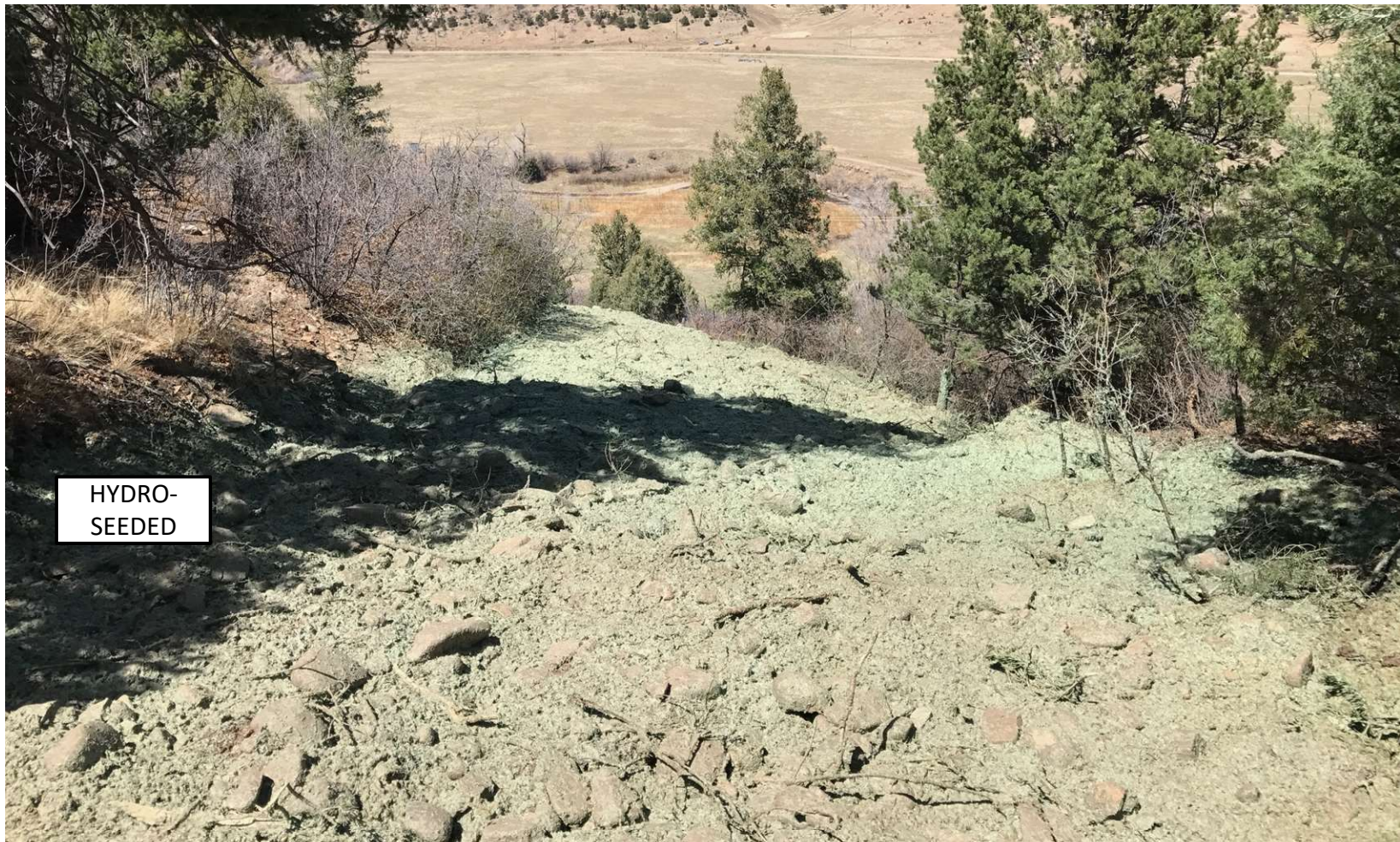
PHOTO 3: FACING NORTH, THE ACCESS ROAD TO GOLDEN EAGLE MINE E-1A PAD WAS RECONTOURED TO MATCH THE SURROUNDING TERRAIN. GRADING TECHNIQUES WERE INSTALLED ON THE CONTOUR. THE EARTH DISTURBANCE WAS HYDRO-SEEDED WITH AN APPROVED COLORADO PARKS AND WILDLIFE (CPW) SEED MIX TO PROMOTE THE ESTABLISHMENT OF VEGETATION.

GOLDEN EAGLE MINE E-1A API# 05-071-06411 – TIMBER CREEK OGCC OPERATOR NUMBER 10672 – INSPECTION DATE: APRIL 19, 2018 CORRECTIVE ACTIONS COMPLETED REGARDING COGCC FIR DOCUMENT # 680102745