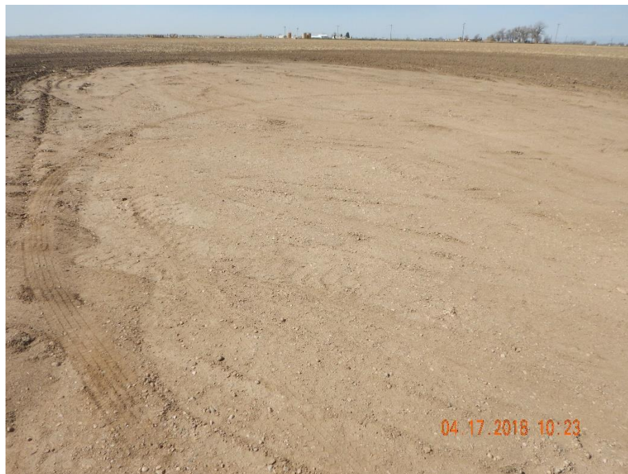
Photo 2: Photo taken from the northeast corner of the former battery location, facing southwest. Photo shows additional reclamation activities have not been performed on the former battery location. Location has not been returned to cropland.