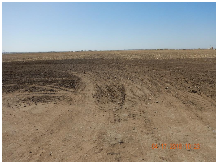
Photo 4: Photo taken from the south end of the former battery location, facing south towards the well location.