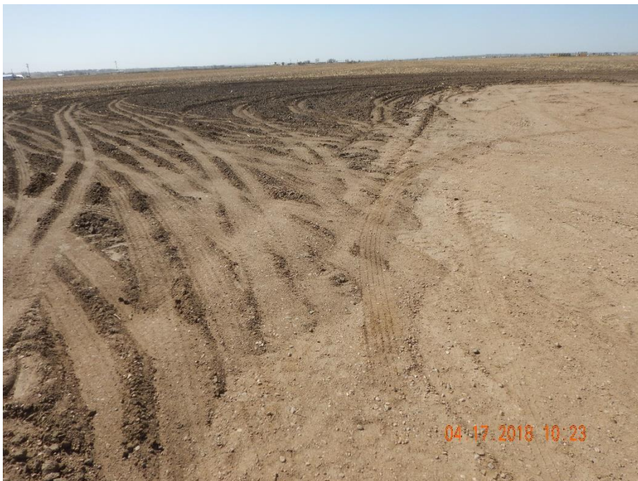
Photo 1: Photo taken from the northeast corner of the former battery location, facing south. Photo shows additional reclamation activities have not been performed on the former battery location. Location has not been returned to cropland.