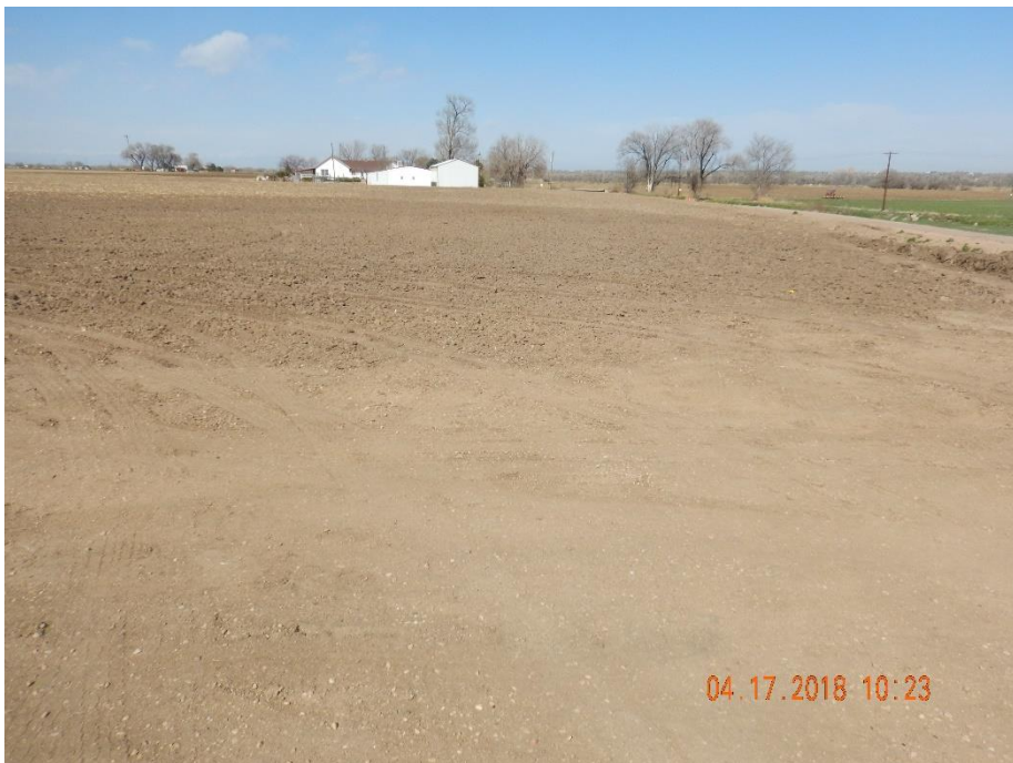
Photo 3: Photo taken from the northeast corner of the former battery location, facing south. Photo shows additional reclamation activities have not been performed on the former battery location. Location has not been returned to cropland.