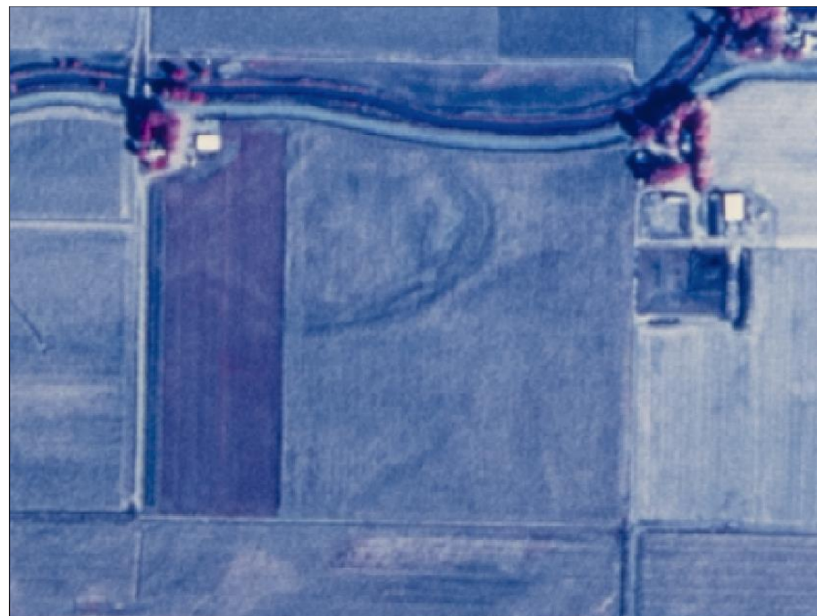
Photo 6: 1984 USGS aerial imagery. Well was SPUD 1985. Photo shows areas requiring reclamation at the former battery location did not pre-exist oil and gas disturbances.