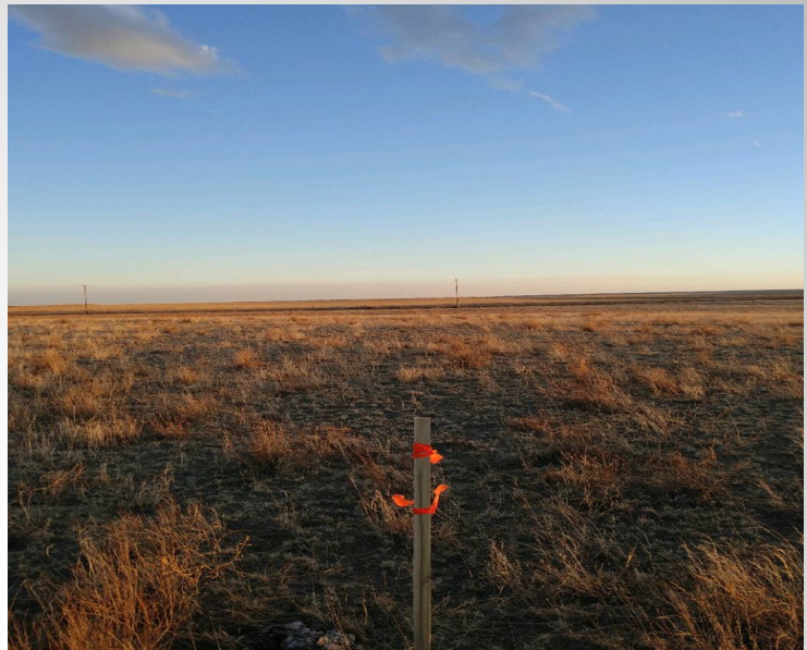
COBANK 13-18 + SOUTH VIEW