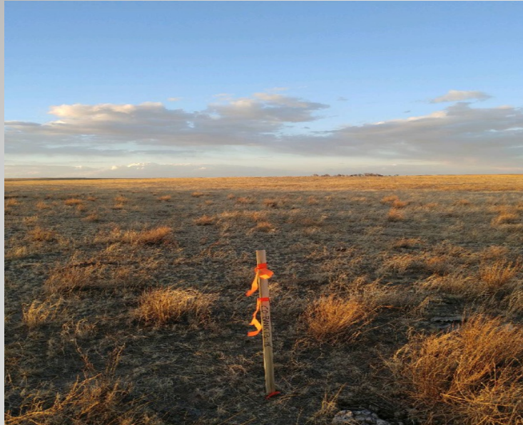
COBANK 13-18 + NORTH VIEW

SHL: SW-1/4 OF SW-1/4 SECTION 18-T15S-R54W-6 TH PM LINCOLN COUNTY, COLORADO