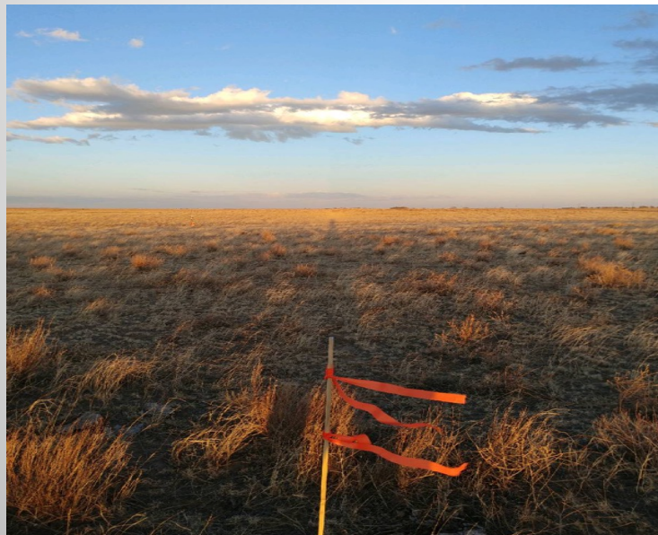
COBANK 13-18 + EAST VIEW