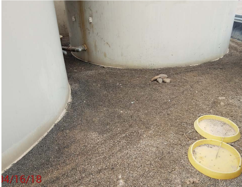
Location photo # 7, stained material in Battery