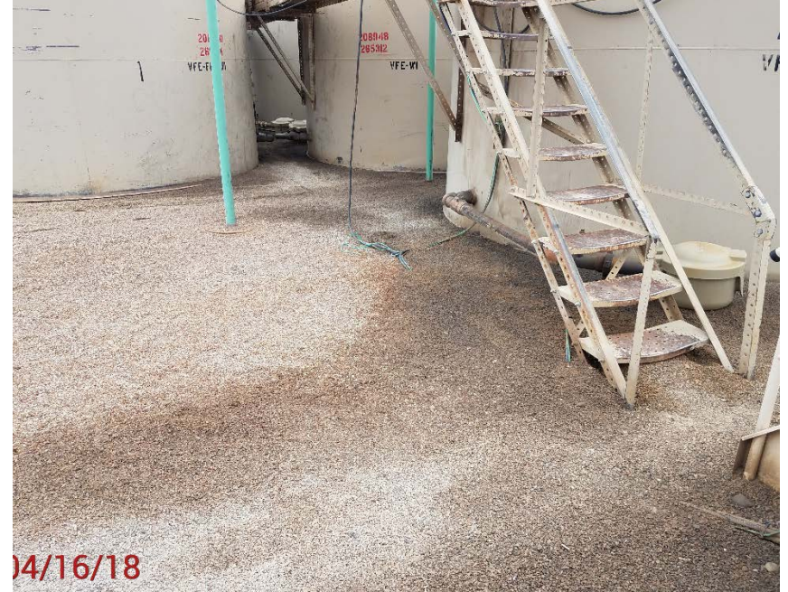
Location Photo #2 Stained material in battery