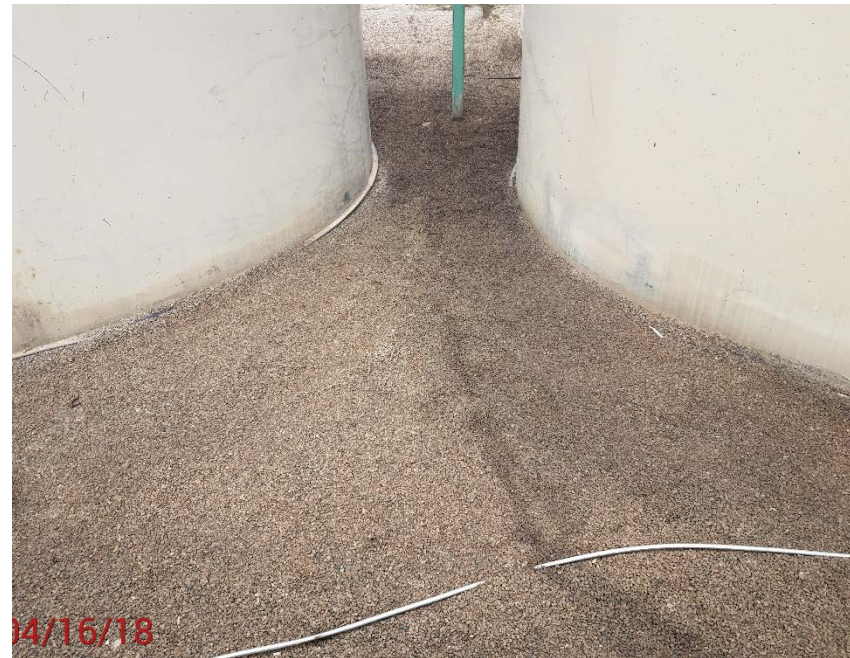
Location Photo # 4, stained material in Battery