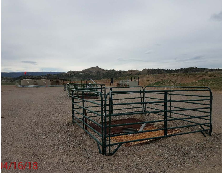
Location photo #1