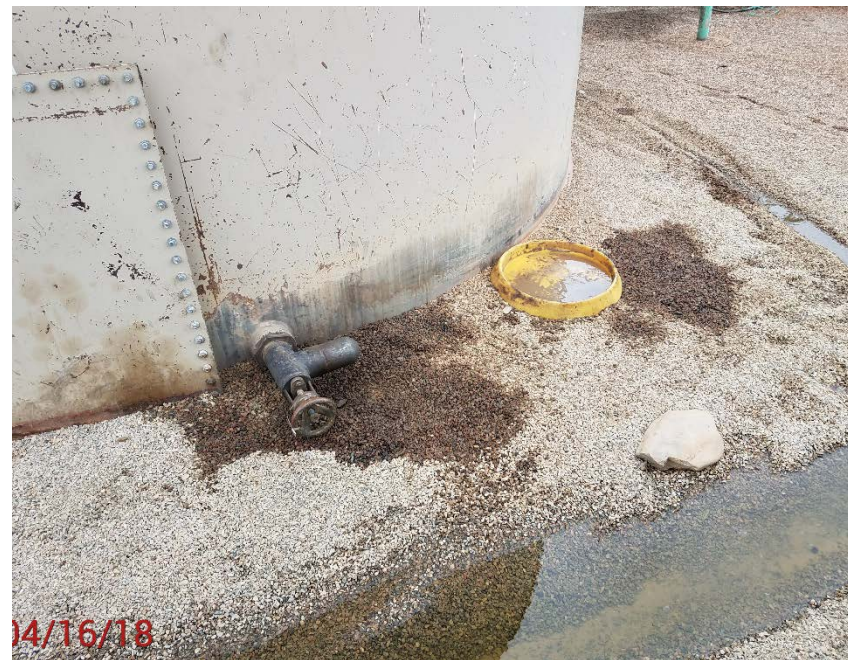
Location Photo # 6, stained material in Battery