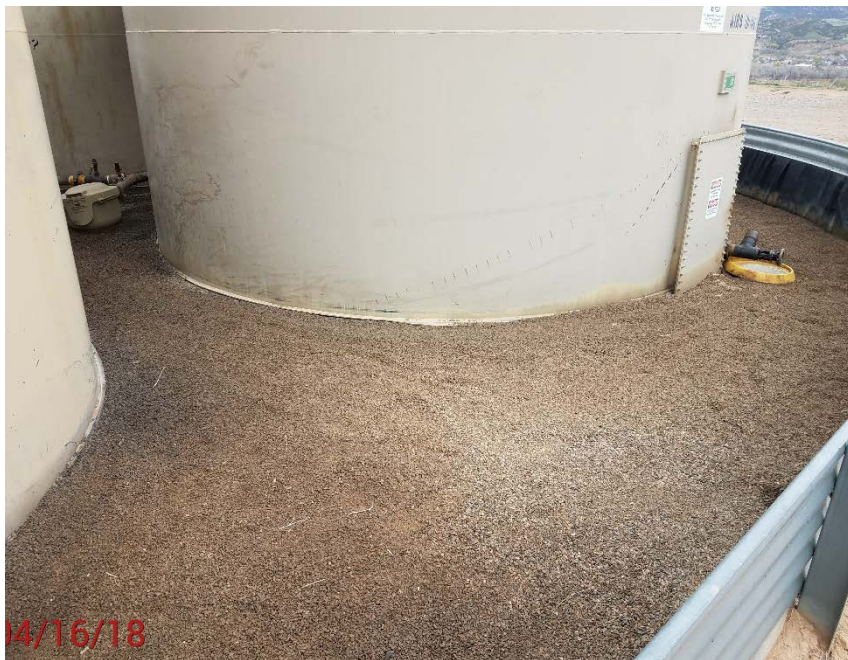
Location photo # 5, stained material in Battery