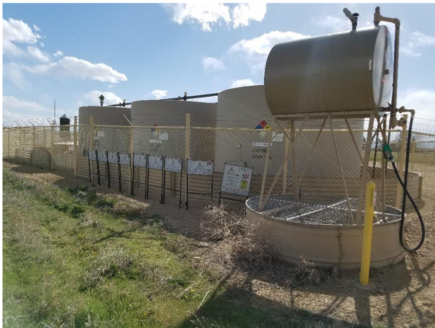
Photo 1. Battery