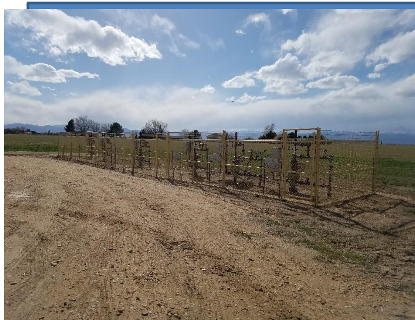
Photo 2. Wellhead