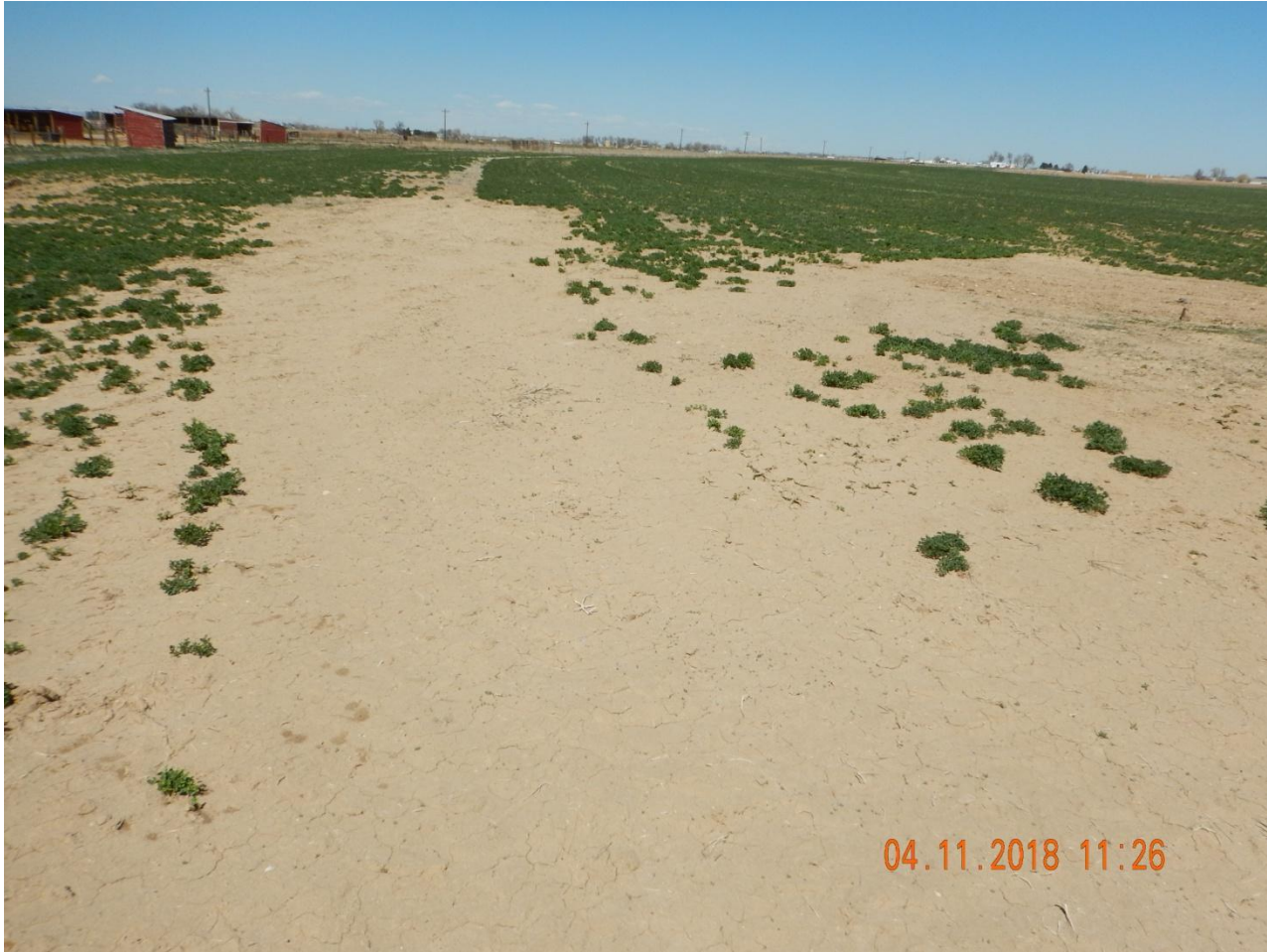
Photo 2. Photo taken from the well location, facing Northwest. There appears to be other disturbances that might be associated with potential flowline abandonment. If that is the case, then the Operator shall comply with Rule 1004 throughout all disturbance areas of the flowline abandonment.