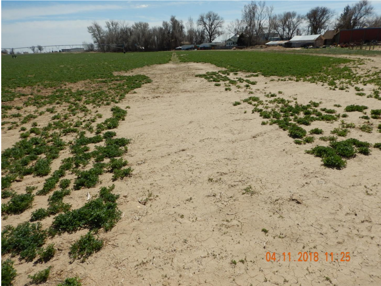
Photo 3. Photo taken from the well location, facing South. See comments under Photo 2.