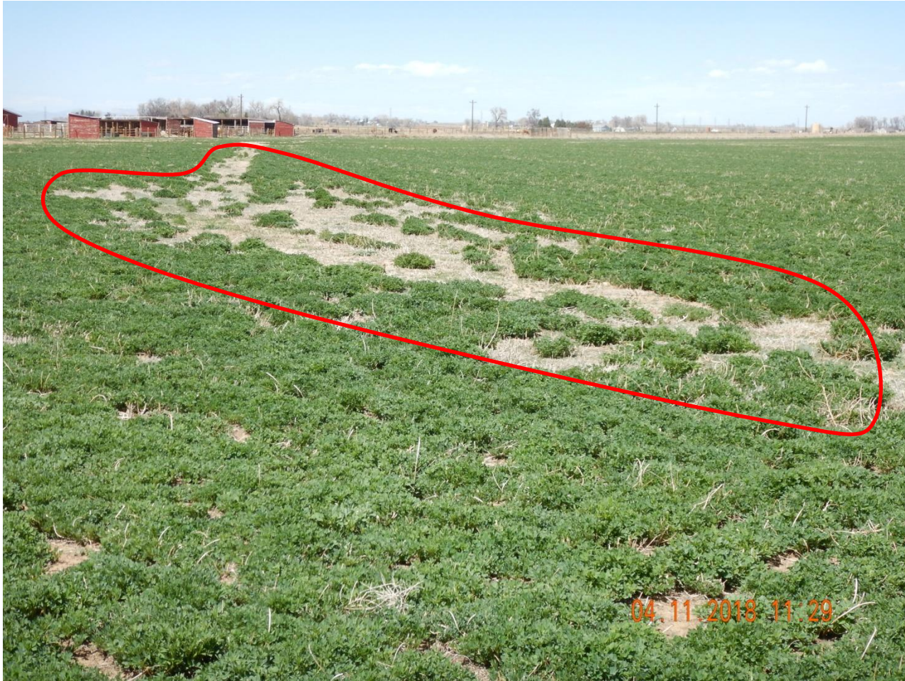
Photo 4. Photo taken east of the well location, facing West. See comments under Photo 2.