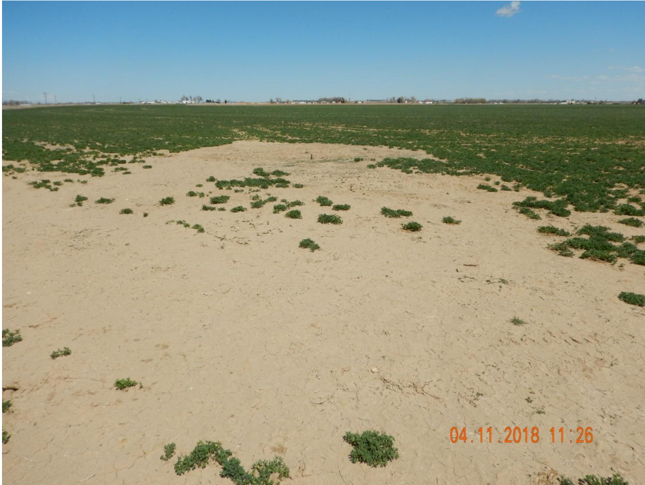
Photo 1. Photo taken from the well location, facing North. Well location is not reflective of reference crop areas (no growth throughout portions surrounding the well location).