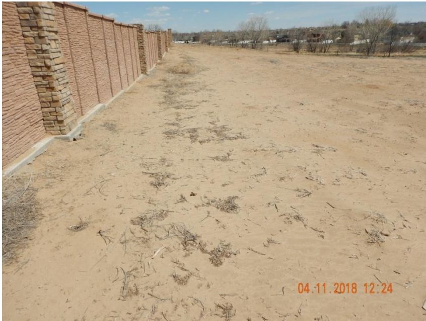
Photo 7. Photo taken from the northern location, facing East. The northern location has not been stabilized and no vegetation was observed throughout any portion.