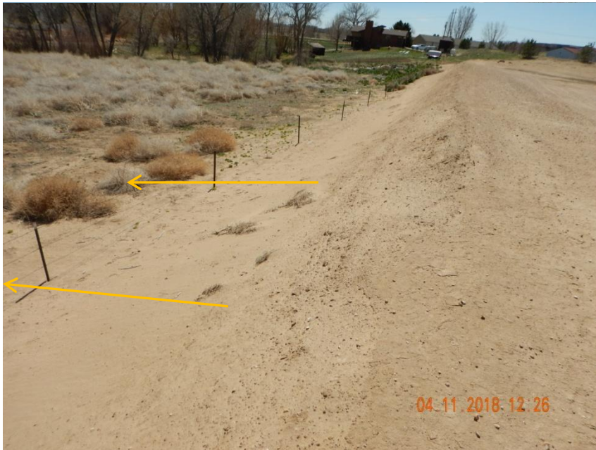
Photo 5. Photo taken from the eastern well pad location, facing South. Photo illustrates fill slopes of the location have not been stabilized and have eroded off location. Kochia and Russian thistle observed east of location which could have established from the well location or the Kelly Farm location.