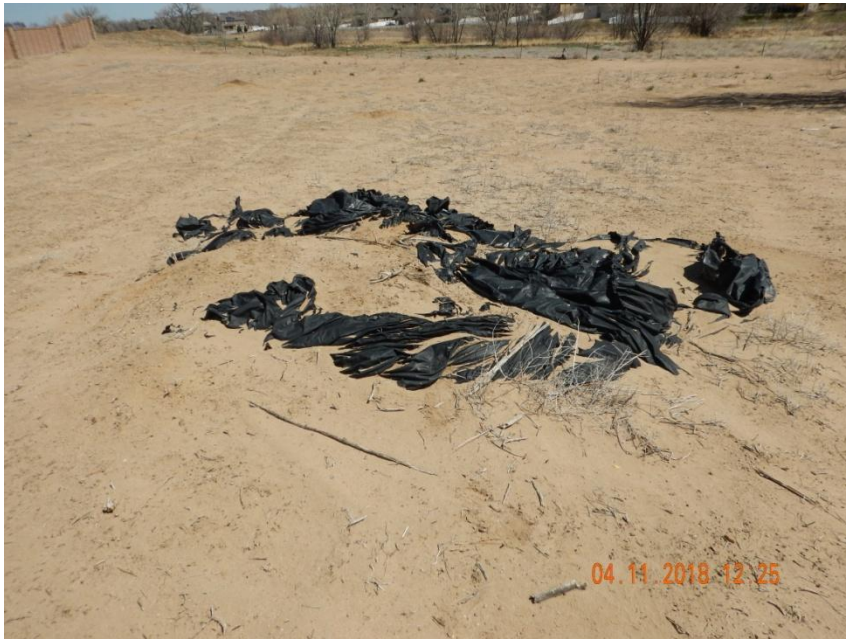
Photo 9. Photo taken from the northern location, facing East. Debris shall be removed per Rule 603.f.