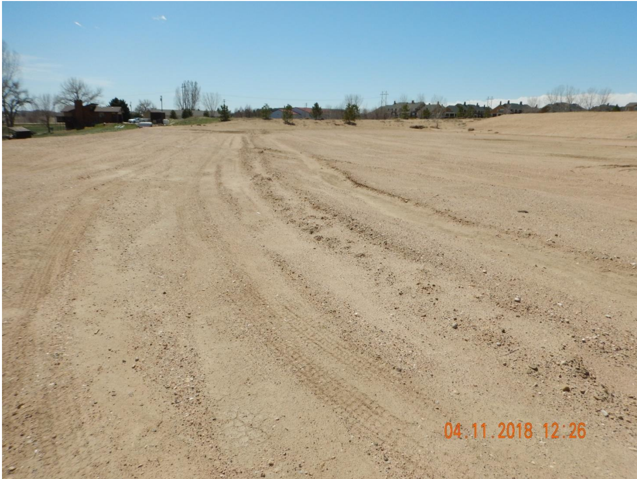
Photo 1. Photo taken from the northern location, facing South. Operator has failed to reclaim the Northridge location per Rule 1004.a. standards.