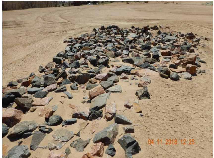
Photo 10. Photo taken from the northern well pad location, facing South. See comments under Photo 3.