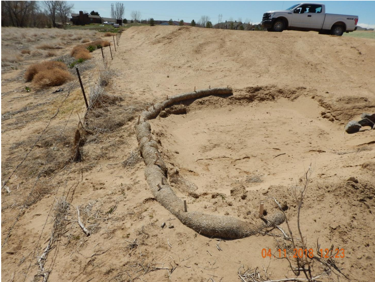
Photo 2. Photo taken from the northeastern location, facing South. Operator has failed to maintain stormwater BMPs per Rule 1002.f.(2). Photo also illustrates fill slopes of the location have not been stabilized and have eroded off location.