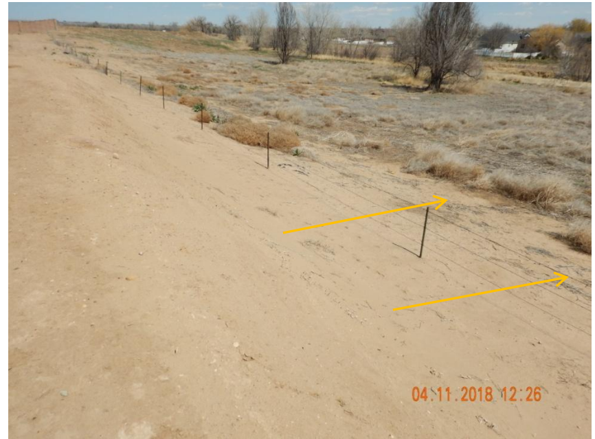
Photo 6. Photo taken from the eastern well pad location, facing North. See comments under Photo 5.