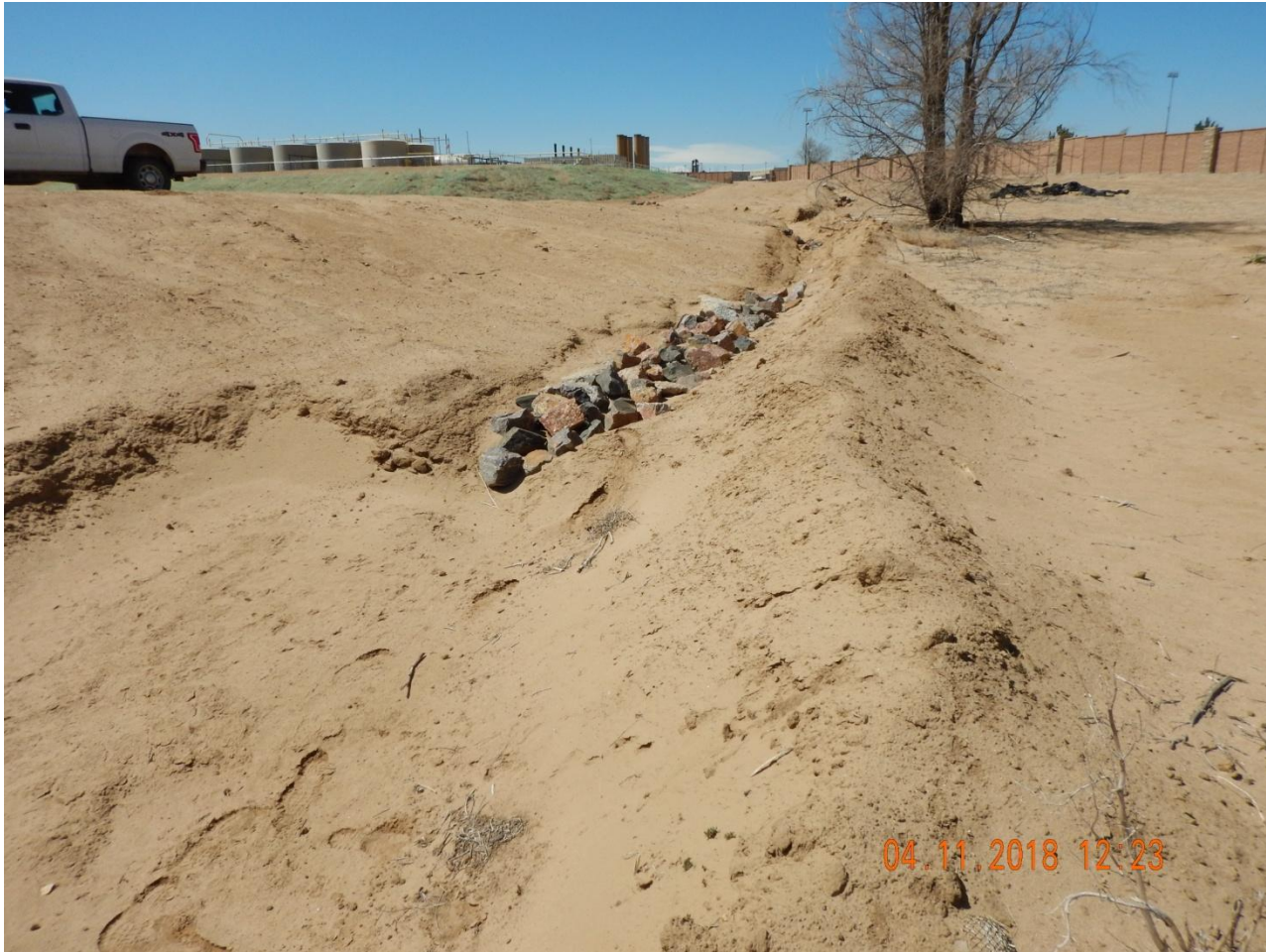
Photo 3. Photo taken from the northeastern location, facing West. Operator has failed to maintain stormwater BMPs per Rule 1002.f.(2).