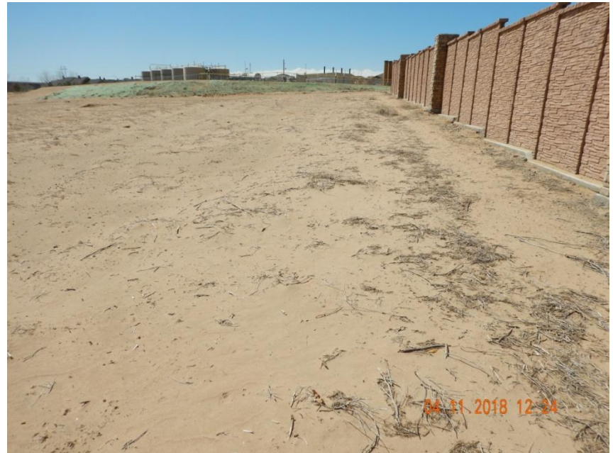
Photo 8. Photo taken from the northern location, facing West. See comments under Photo 7.