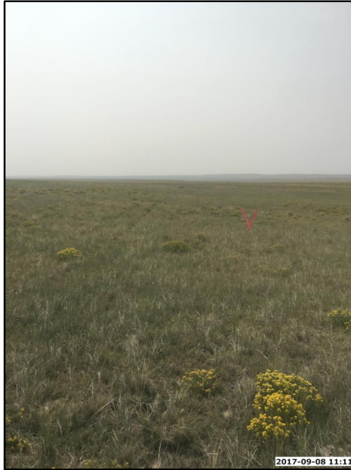
PICTURE OF SALT RANCH FEE 18 EAST REFERENCE AREA - CAMERA ANGLE SOUTH