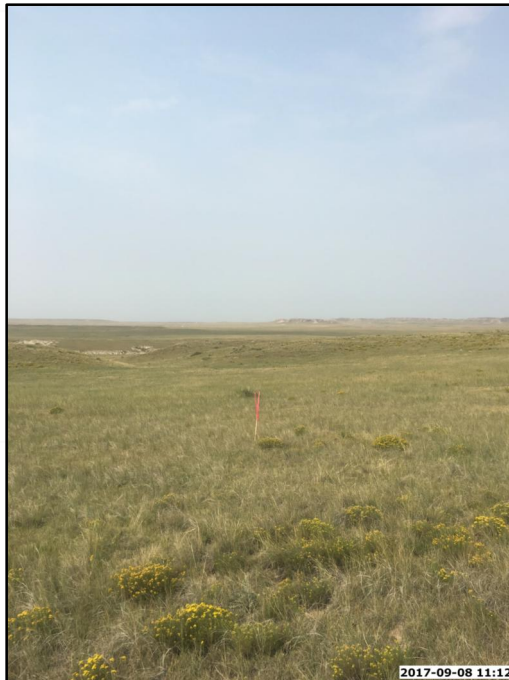
PICTURE OF SALT RANCH FEE 18 EAST REFERENCE AREA - CAMERA ANGLE WEST