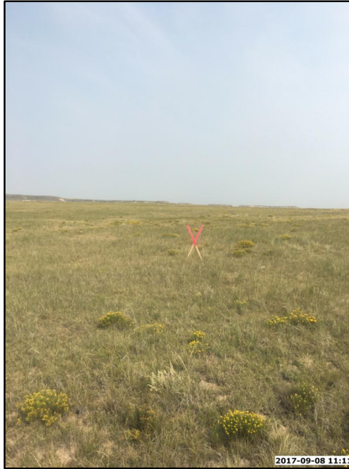
PICTURE OF SALT RANCH FEE 18 EAST REFERENCE AREA - CAMERA ANGLE NORTH