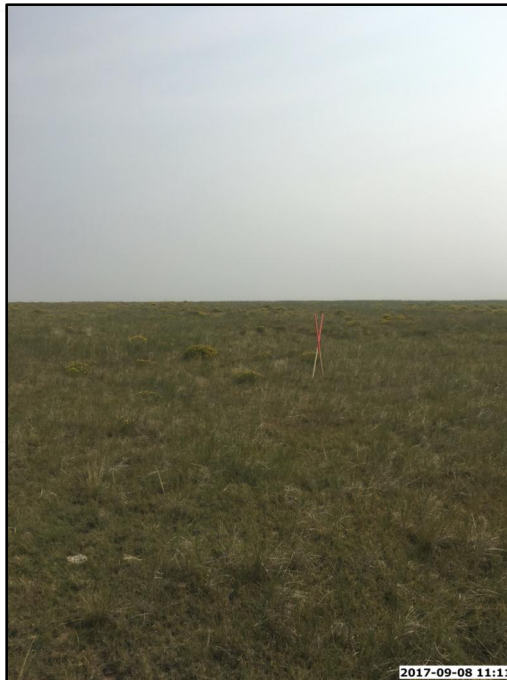
PICTURE OF SALT RANCH FEE 18 EAST REFERENCE AREA - CAMERA ANGLE EAST