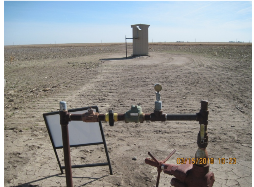
2. Wellhead and Meter shed