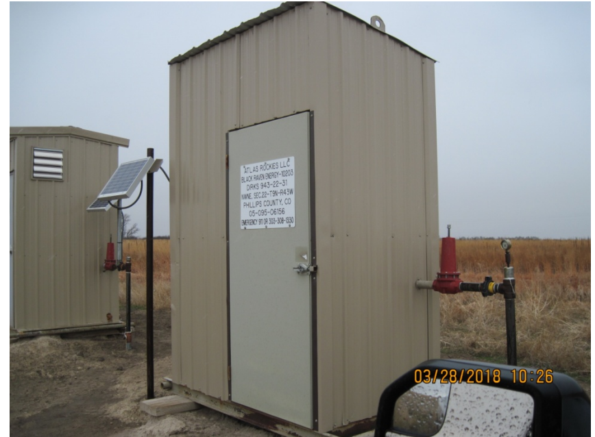
2. Meter shed