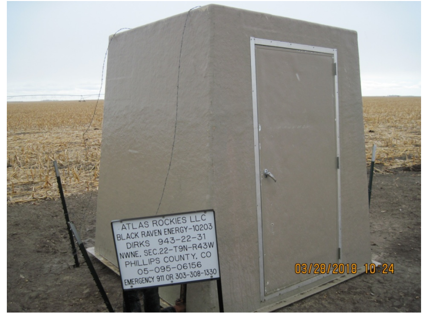
4. Fiberglass shed over wellhead and equipment