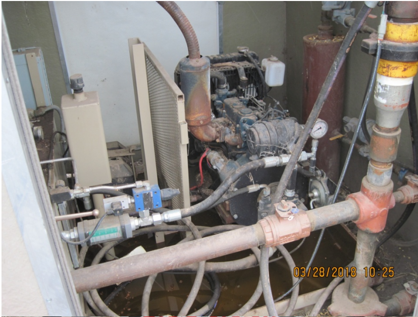
3. Wellhead equipment