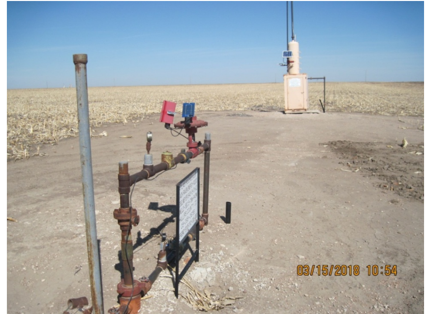
2. Wellhead and Meter shed