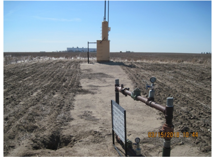
2. Wellhead and Meter shed