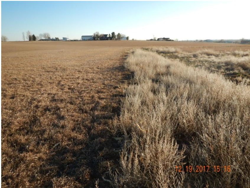
Photo 3. Photo taken from the southeastern location on December 19, 2017, facing South. See comments under Photo 1.