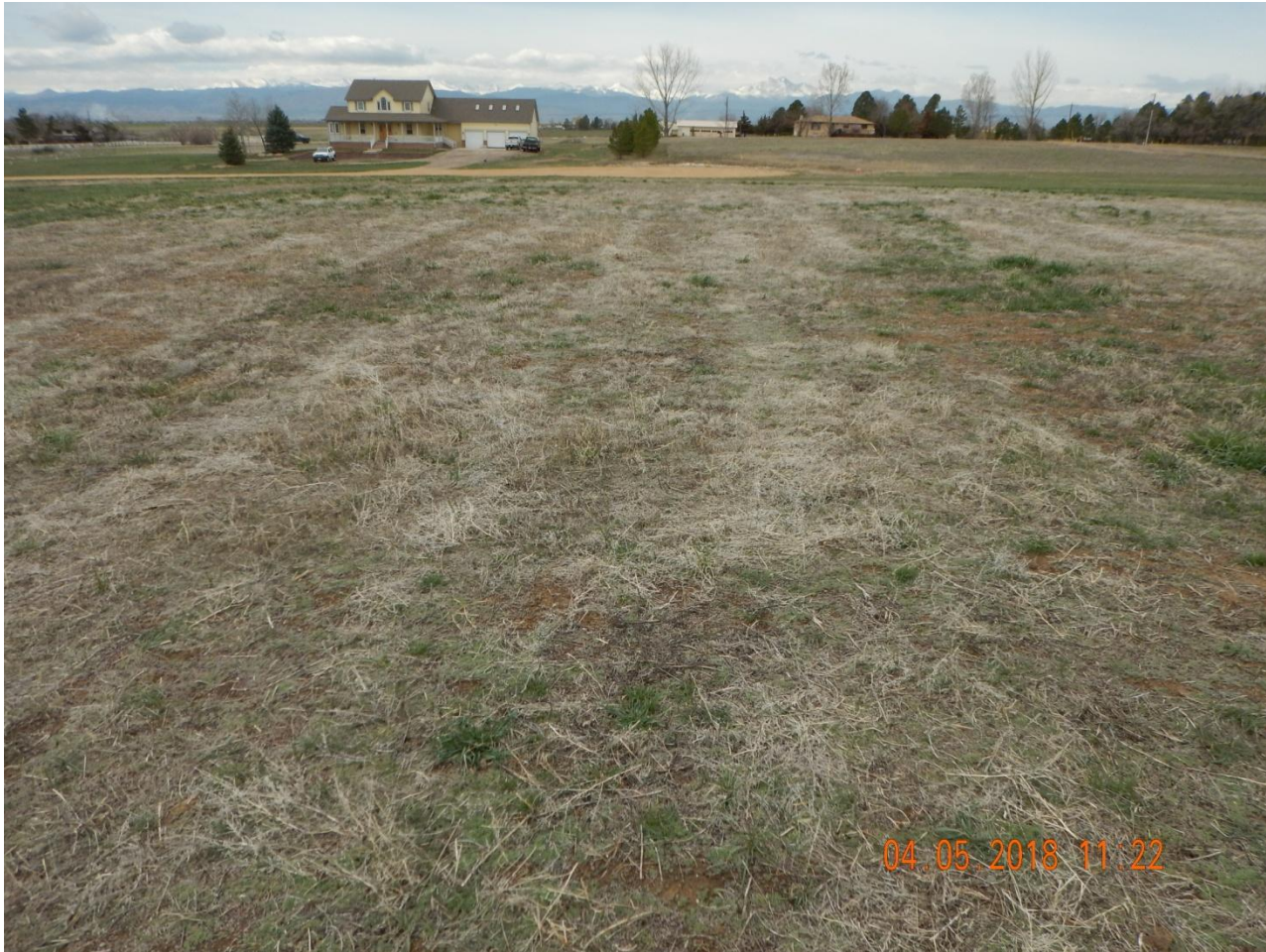
Photo 11. Photo taken from the southwest location on April 5, 2018, facing West. See comments under Photo 9.