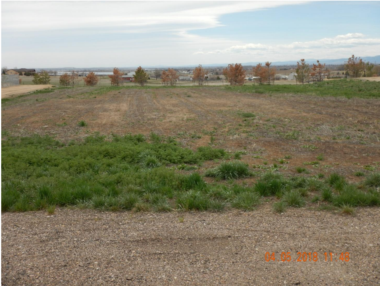
Photo 13. Photo taken from the central location on April 5, 2018, facing South. See comments under Photo 9.