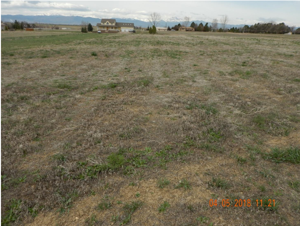
Photo 10. Photo taken from the southwestern location on April 5, 2018, facing West. See comments under Photo 9.