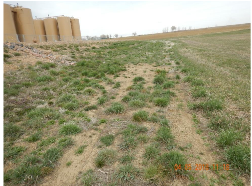
Photo 2. Photo taken from the eastern location on April 5, 2018, facing North. Appears the Operator has mowed Kochia since the previous inspection. Does not appear the Operator has performed the other required interim reclamation activities due on or before April 30, 2018.