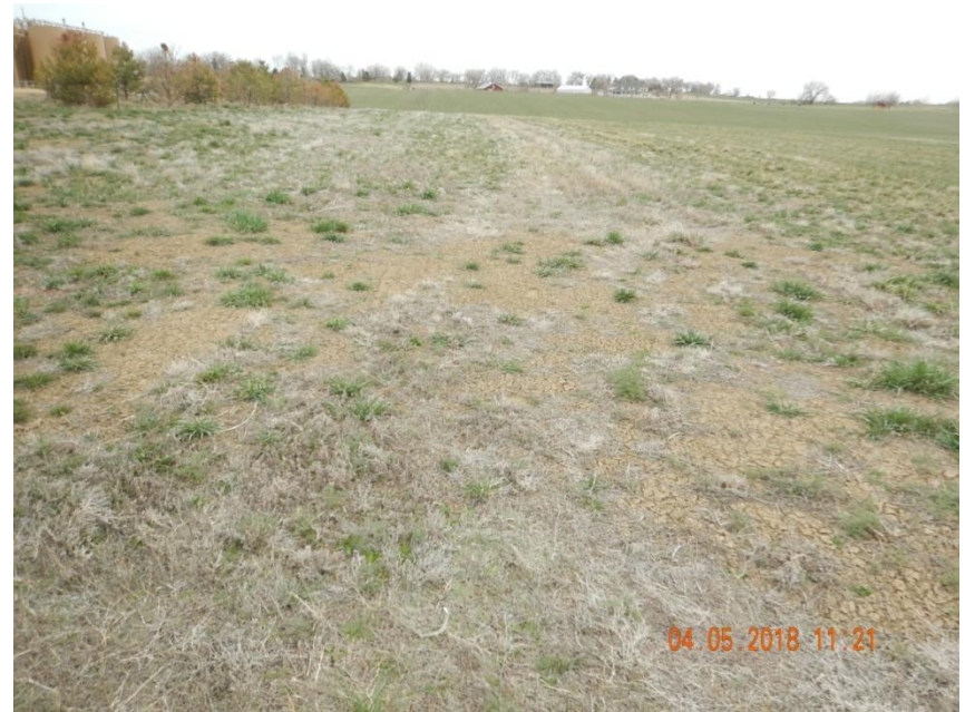
Photo 8. Photo taken from the southwestern location on April 5, 2018, facing East. See comments under Photo 2.