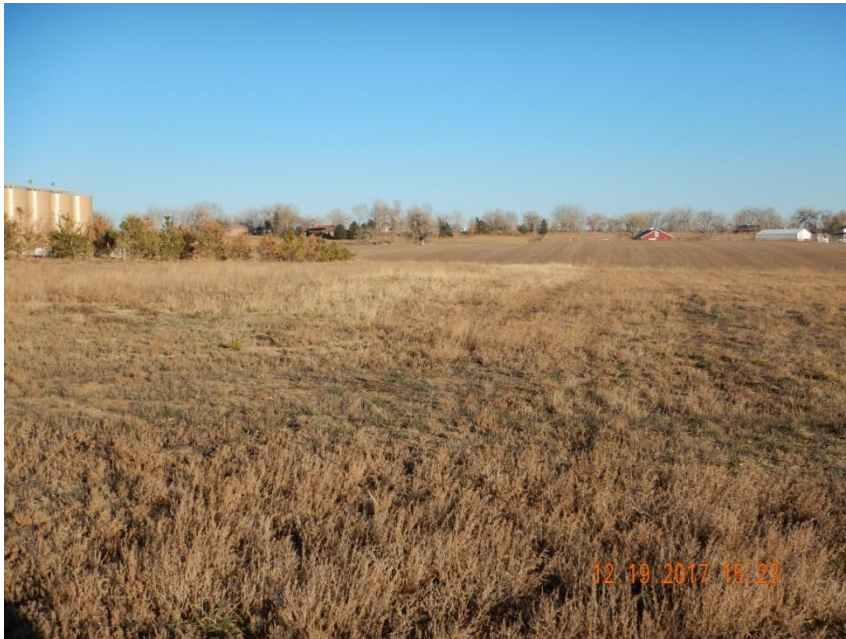
Photo 7. Photo taken from the southwestern location on December 19, 2017, facing East. See comments under Photo 1.