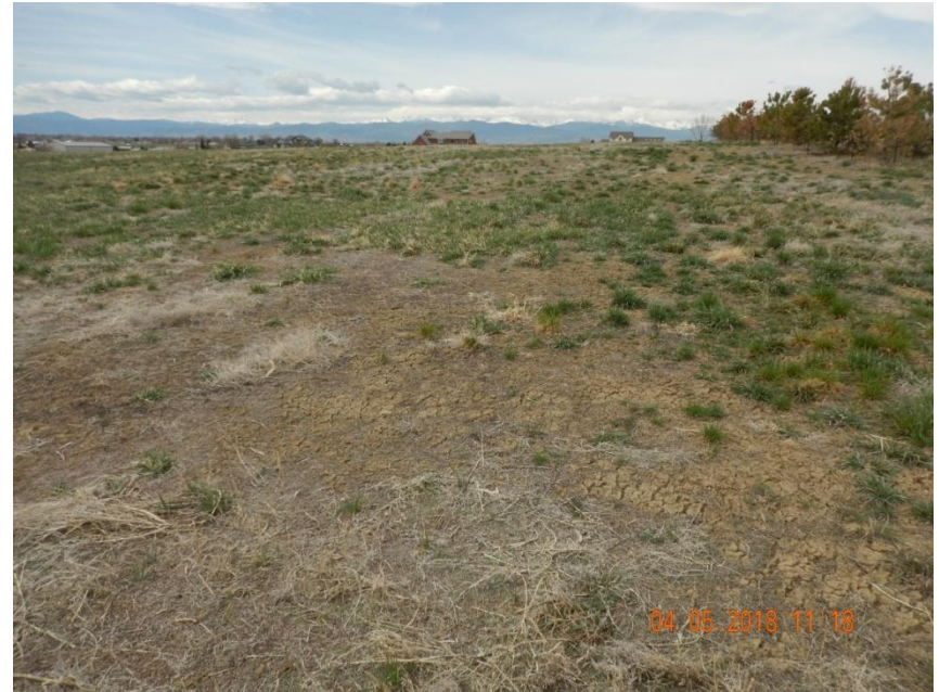
Photo 6. Photo taken from the southeastern location on April 5, 2018, facing West. See comments under Photo 2.