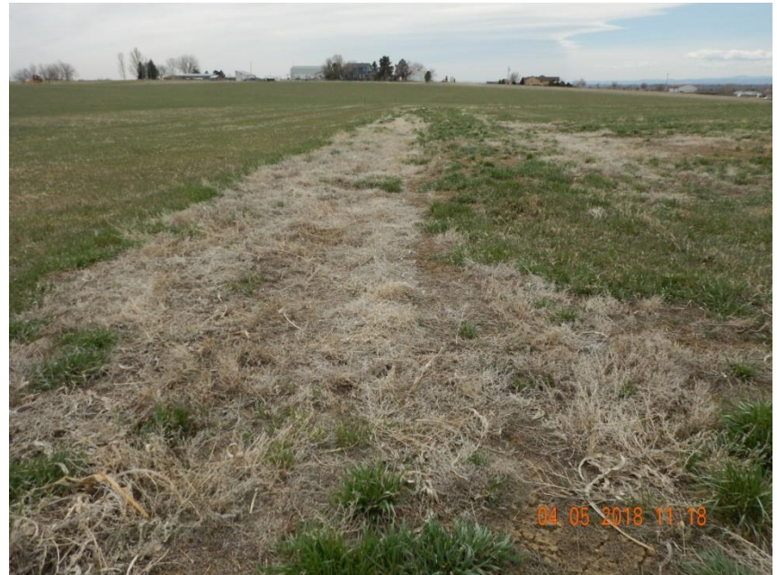
Photo 4. Photo taken from the southeastern location on April 5, 2018, facing South. See comments under Photo 2.