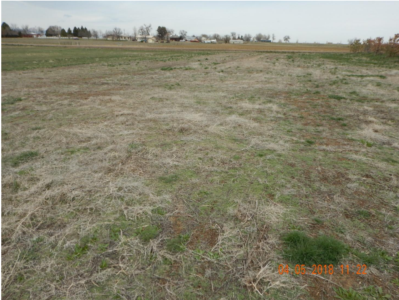
Photo 12. Photo taken from the southwest location on April 5, 2018, facing North. See comments under Photo 9.