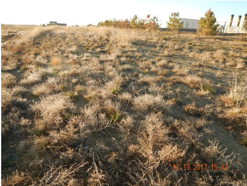
Photo 5. Photo taken from the southeastern location on December 19, 2017, facing West. See comments under Photo 1.