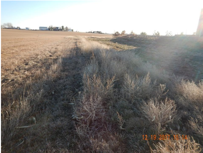
Photo 1. Photo taken from the eastern location on December 19, 2017, facing South. Interim reclamation areas are not reflective of reference area vegetative levels. Kochia ( Kochia scoparia ) is the dominate vegetative growth throughout the southern interim reclamation area. Some portions appear to be mowed while other portions have not been controlled.