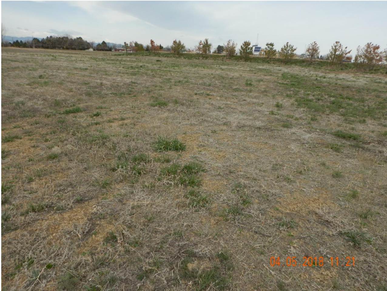
Photo 9. Photo taken from the southwestern location on April 5, 2018, facing Northwest. Photo illustrates the lack of desirable germination establishment which is not reflective of reference areas. See Photo 14 of a reference area vegetative photo.