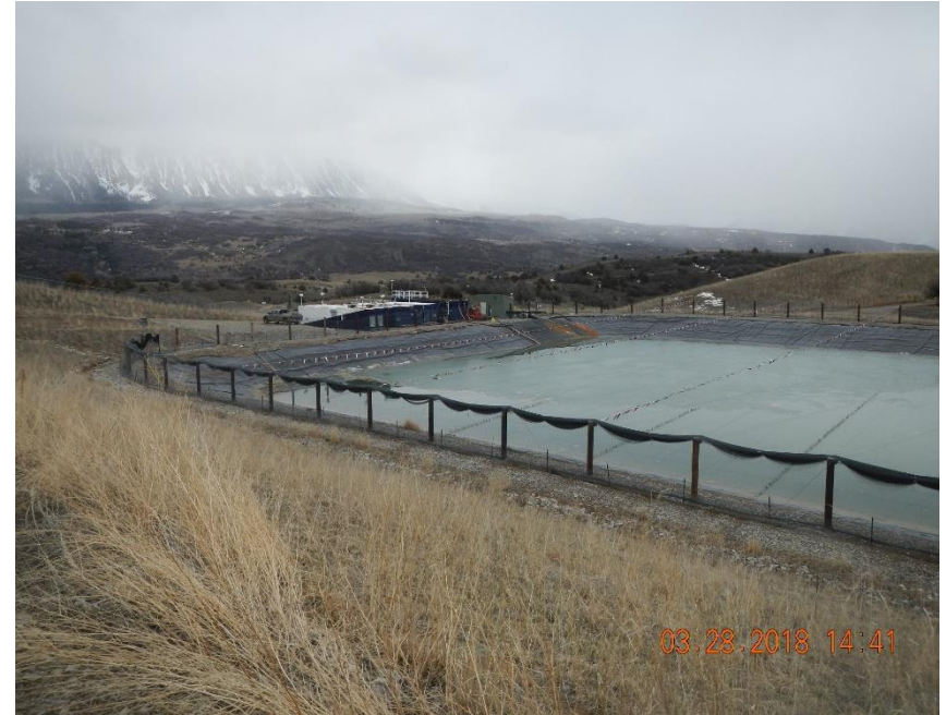
View of southern pit, looking east.