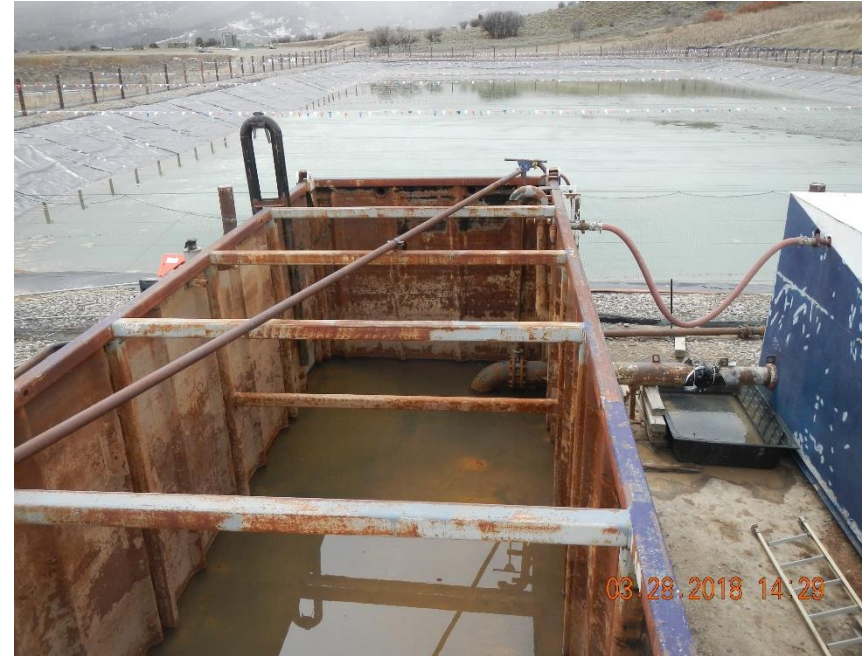
Open topped frac tank plumbed to pump house.