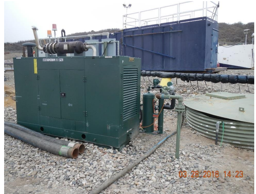
Natural gas powered generator.