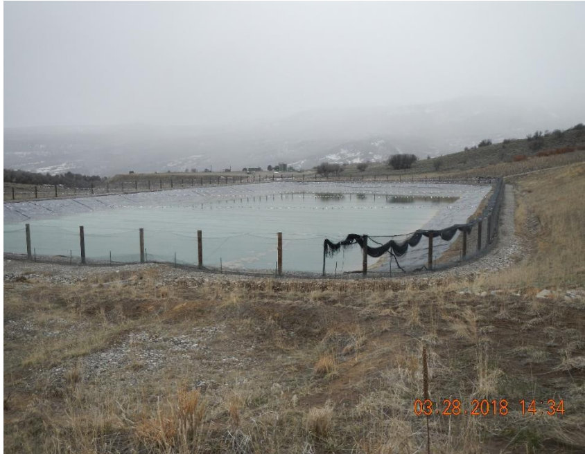
Southern pit with netting retracted.