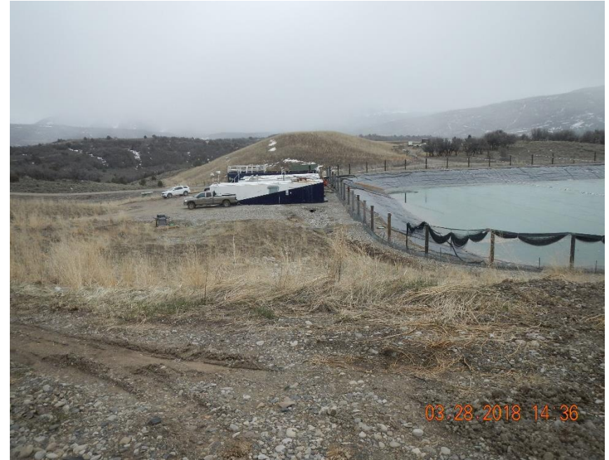
Facility ID #421193 ancillary equipment adjacent to southern pit.