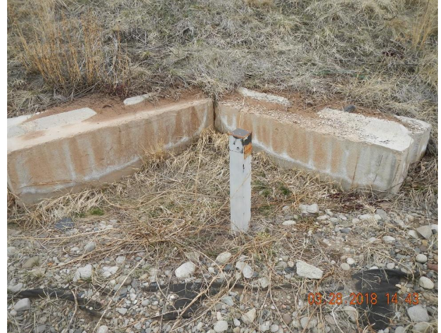
MW #3 between northern and southern pits.