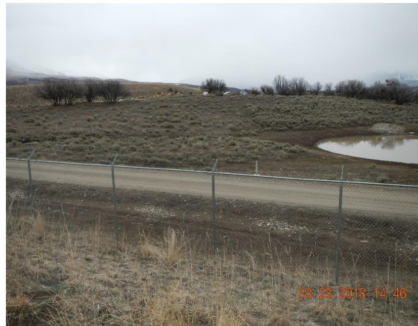
MW #2 and stock pond down gradient of facility.