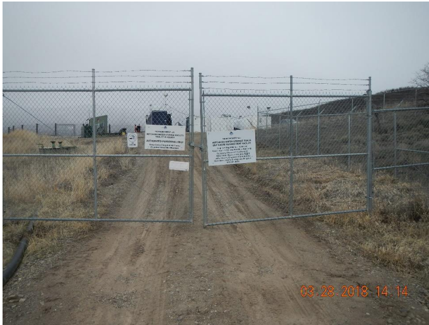
Facility entrance gate.