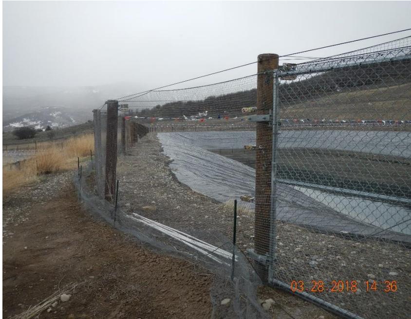
Northern pit. Netting was retracted during this inspection.