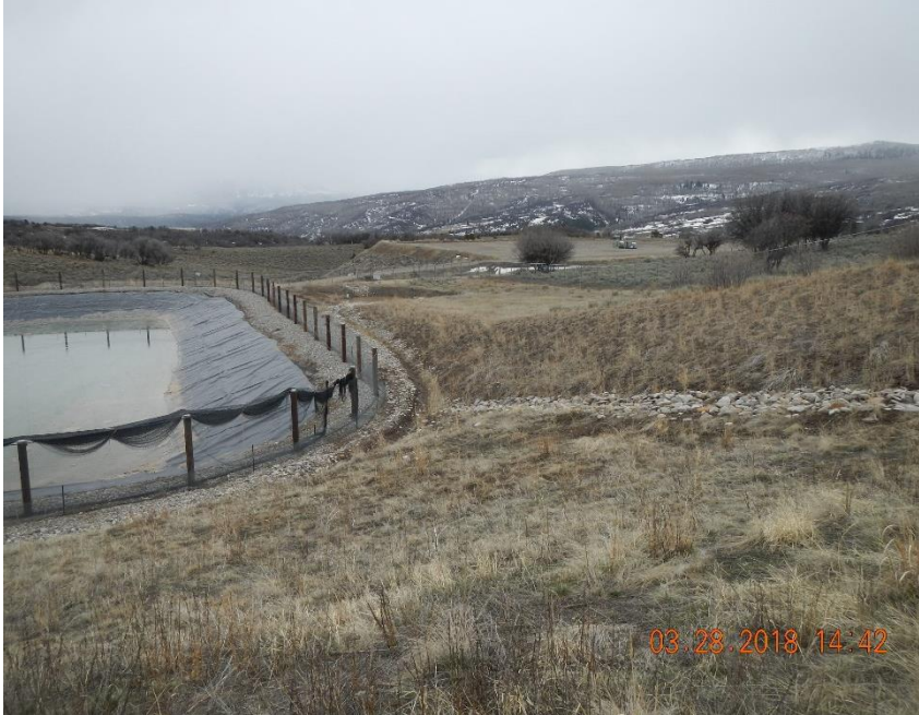
Storm water BMPs along western edge of facility.