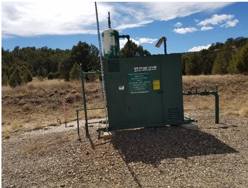
Photo 1. Location sign