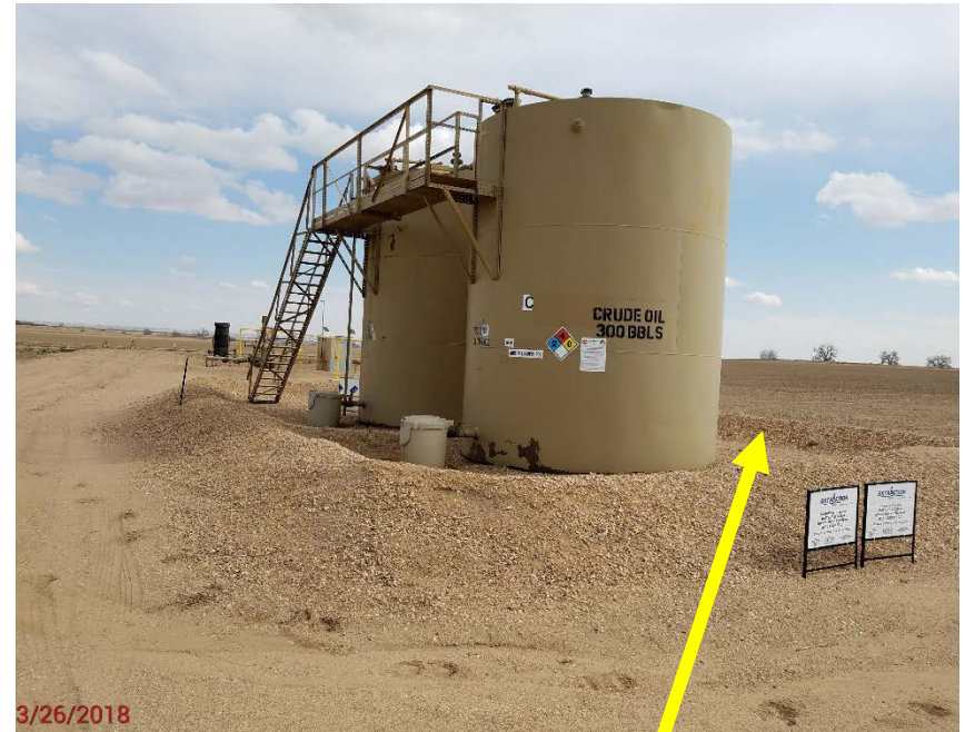
Tank Battery facing SE. Berms appear inadequate for containment.