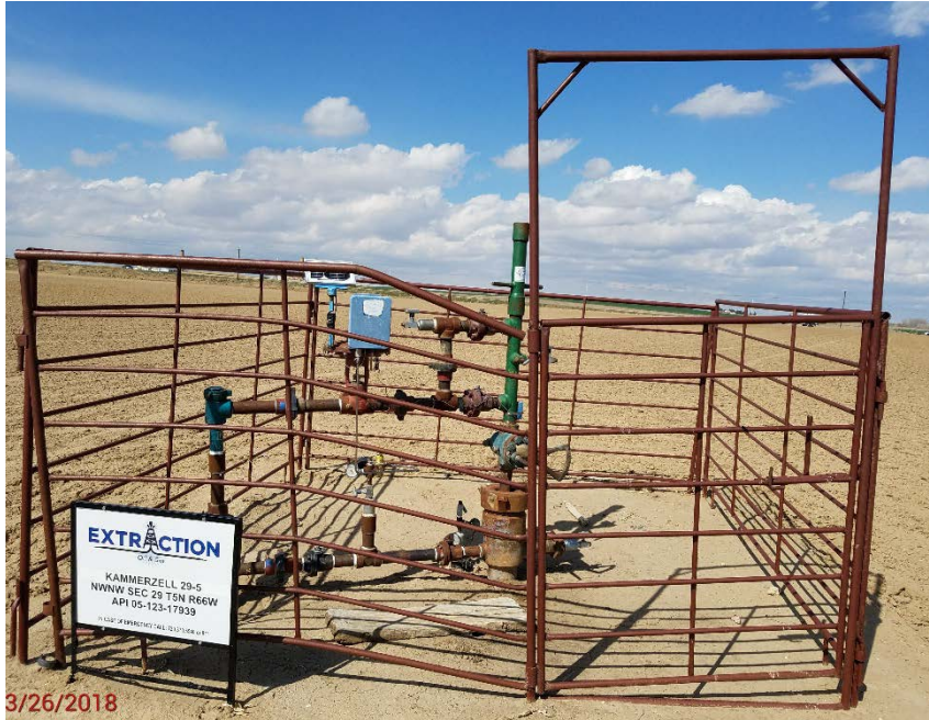
Kammerzell 29-5 well facing N.