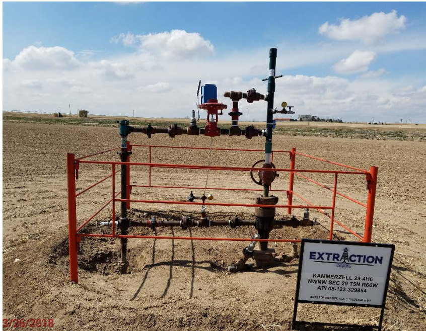
Kammerzell 29-4 H6 wellhead facing W.