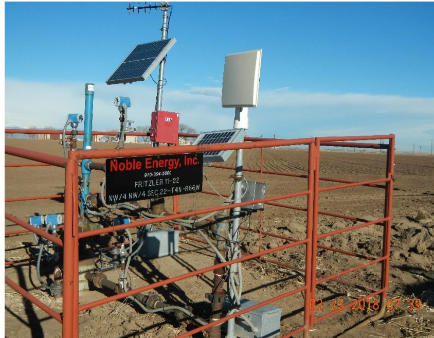
Wellhead from E view