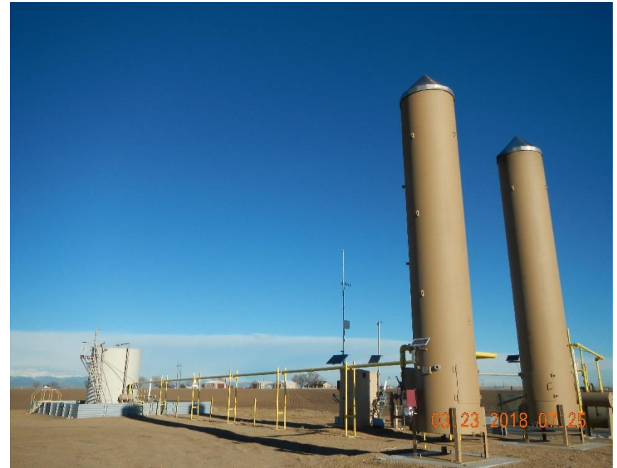
Tank battery site from SE view