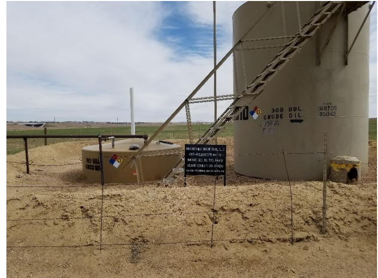
Photo 2. Tank battery