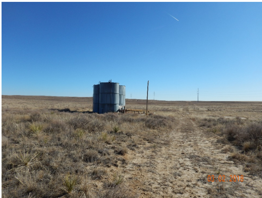
Photo #1 – Unlabeled modular steel ASTs with flowline manifold and two-track access road, looking east.