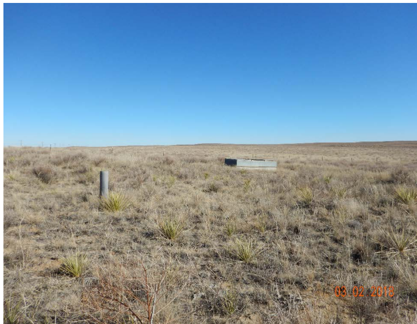
Photo #3 – Ancillary equipment located ~100' west of modular ASTs.