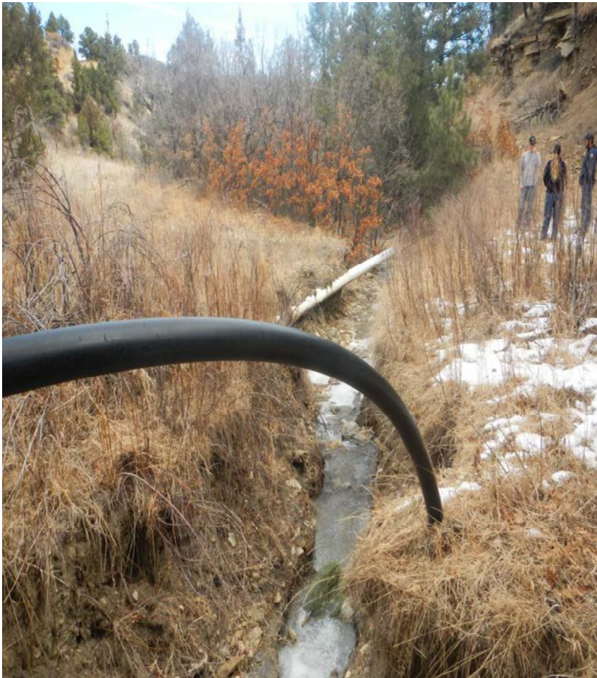
Photo#3: Plastic & Metal Piping, risers & valves remain in creek bottom Southwest of Well.