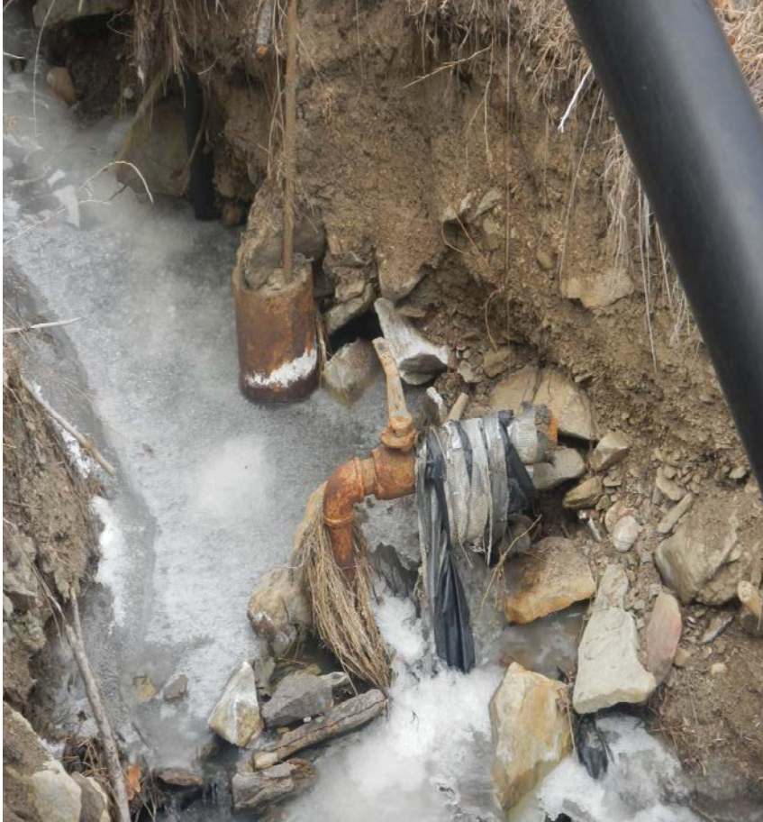
Photo#5: Plastic & Metal Piping, risers & valves remain in creek bottom Southwest of Well.