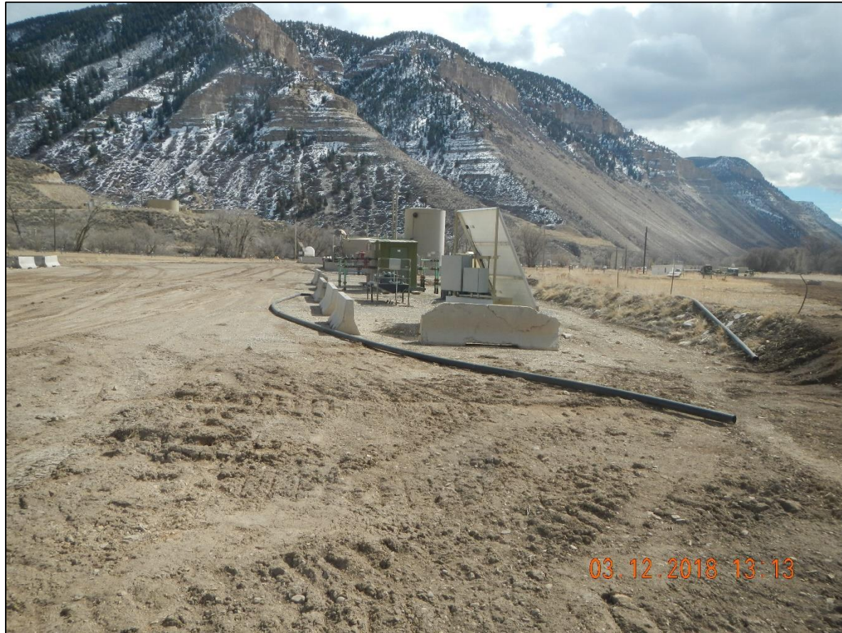
Cut off poly pipe on location.