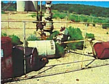
#1 Hamm Canyon 14-26 05/26/05

Excess equipment and trash is present inside the fenced area around the wellhead. Wellsigns placed at the entrance to the Hamm Canyon Road (off San Miguel County Road U29), and at the location should be replaced. Excess equipment including 55 gallon drums (unlabeled) are present on the location. Rabbitbrush growing inside fenced areas has the potential to become a safety/health concern. Facilities on location need to be repainted with appropriate paint color, as specified in the Conditions of Approval (APD), attached to the original Application for Permit to Drill.