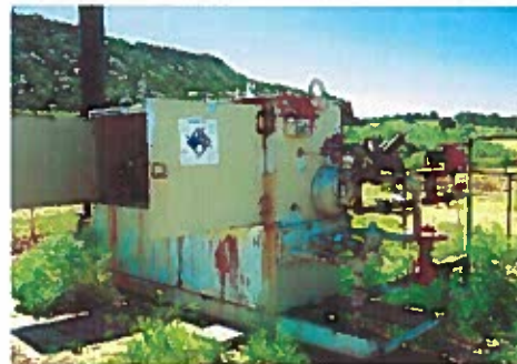
#1 Hamm Canyon 14-26 05/26/05