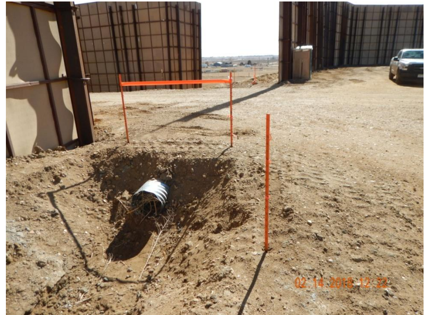
Photo 4. Photo taken from the entrance of the well location, facing South. Operator has installed a ditch BMP along the well location perimeter which is directed to retention areas.