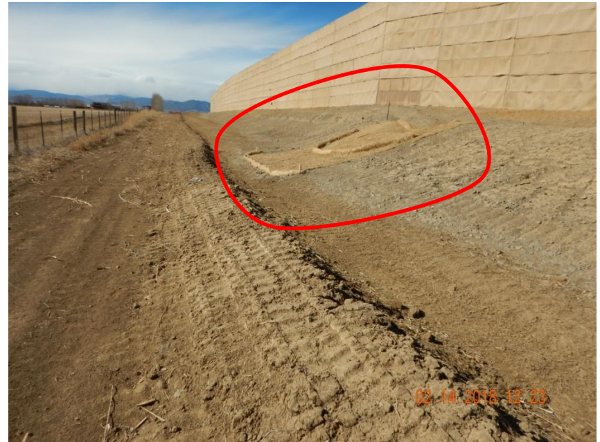
Photo 8. Photo taken from the southeast location, facing West. See comments under Photo 6 regarding the stabilized outlet (spillway).