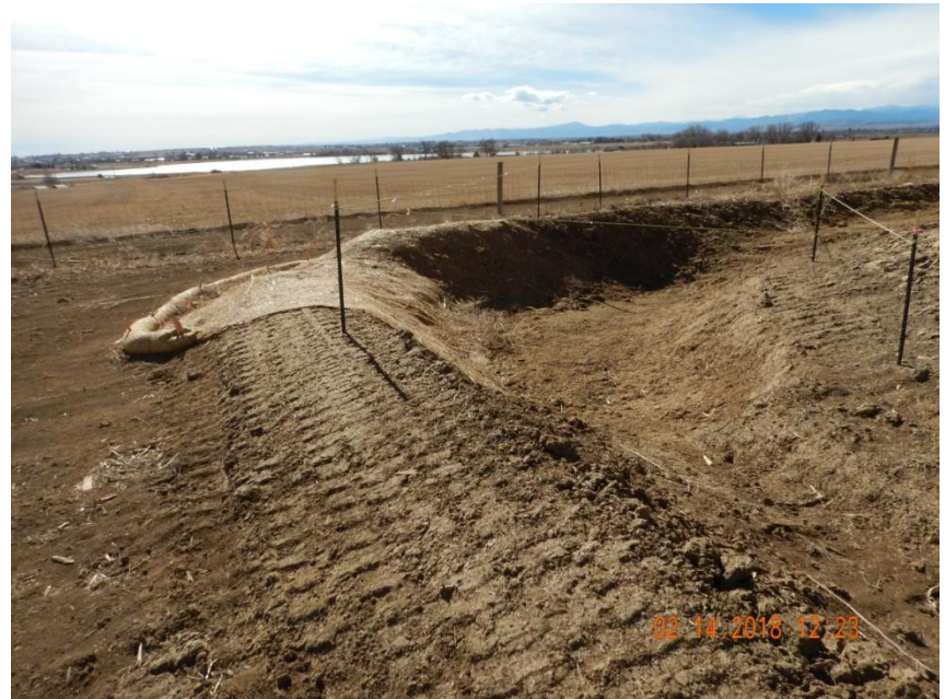
Photo 6. Photo taken from the southeast location perimeter, facing South. Operator has installed a stabilized outlet (spillway) along the outer perimeter ditch. It should be noted blankets used for a stabilized outlet would only be considered a temporary BMP. If the stabilized outlet is intended to be a permanent BMP, more appropriate material should be installed (i.e., riprap).