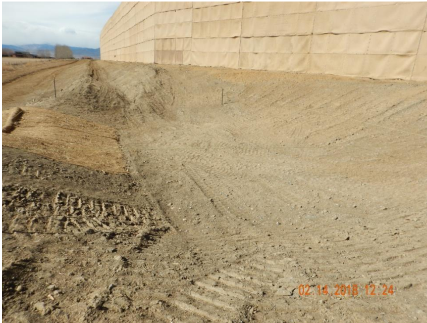
Photo 7. Photo taken from the southeast location, facing West. Operator has installed a retention area in conjunction to the well pad ditches.