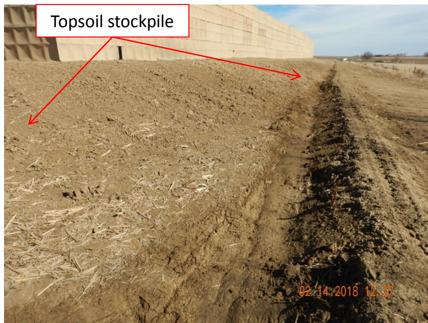
Photo 9. Photo taken from the southwest location, facing East. Appears topsoil has been salvaged and stored along the southern and western perimeter of the location.