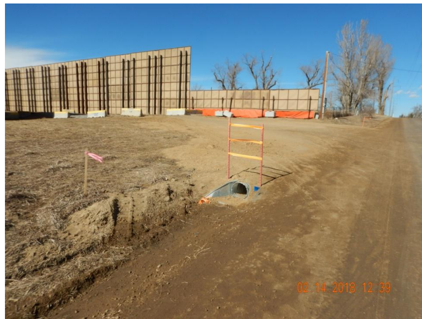
Photo 2. Photo taken from the entrance of location, facing North. Operator has installed a culvert along the roadside ditch.