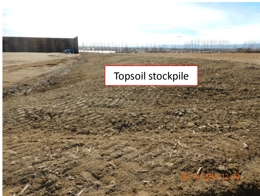
Photo 11. Photo taken from the northwest location, facing South. See comments under Photo 9.