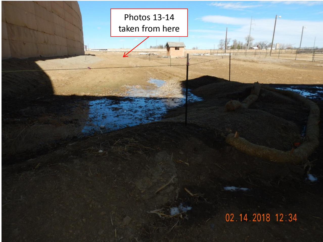
Photo 15. Photo taken from the eastern, facing North. See comments under Photo 6 regarding the stabilized outlet (spillway).