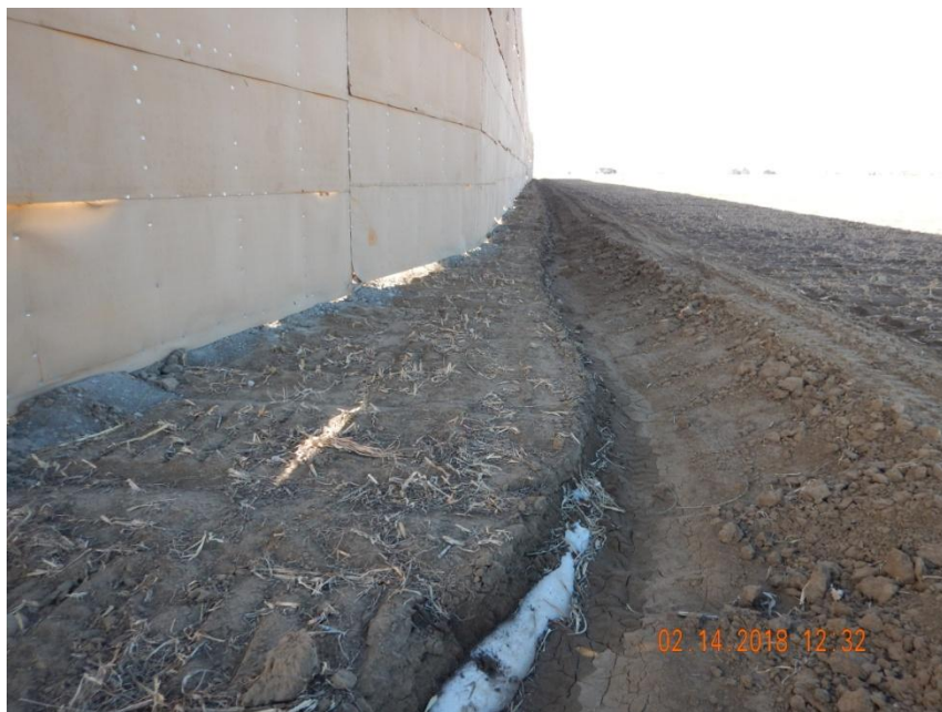
Photo 13. Photo taken from the northeast location, facing West. See comments under Photo 4.