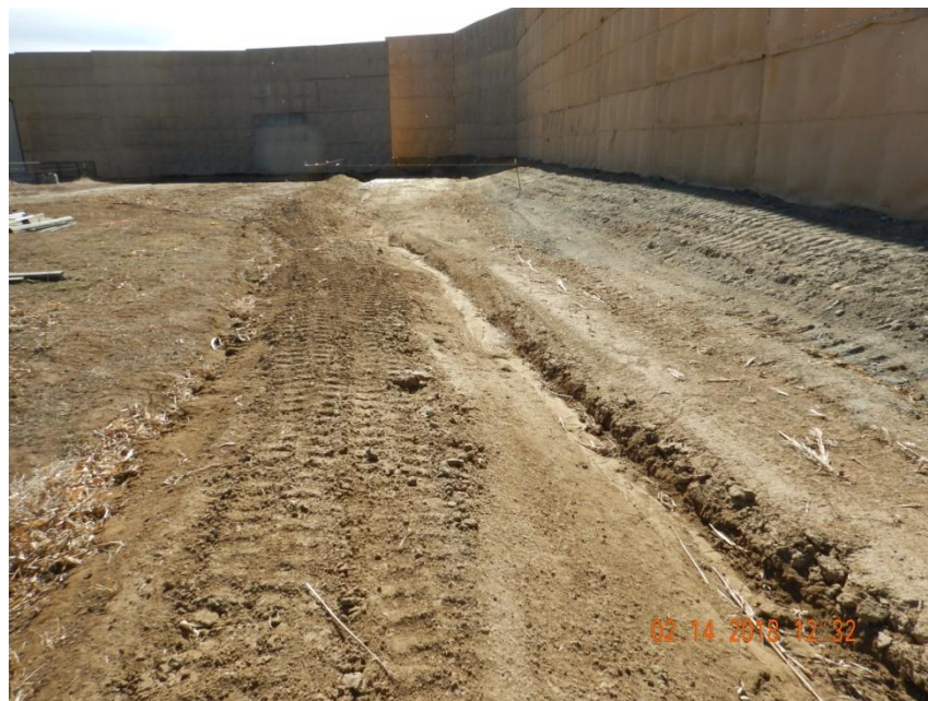
Photo 14. Photo taken from the northeast location, facing South. See comments under Photo 4.