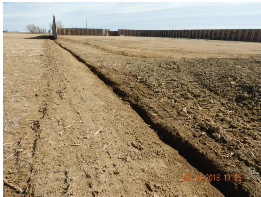
Photo 12. Photo taken from the northwest location, facing East. See comments under Photo 4.