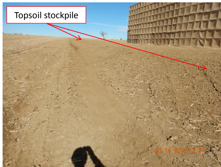
Photo 10. Photo taken from the southwest location, facing North. See comments under Photo 9.