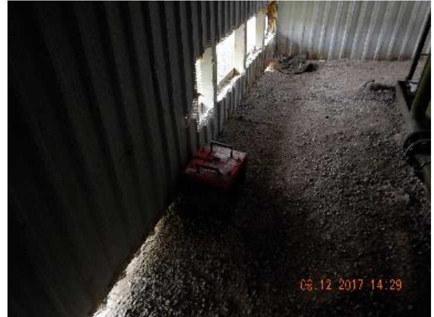
Photo 4: Batteries inside compressor building previous inspection.